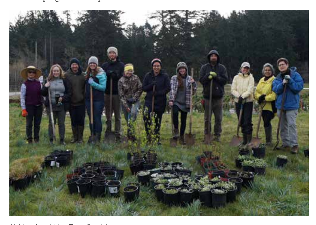
Habitat Acquisition Trust, Saanich.