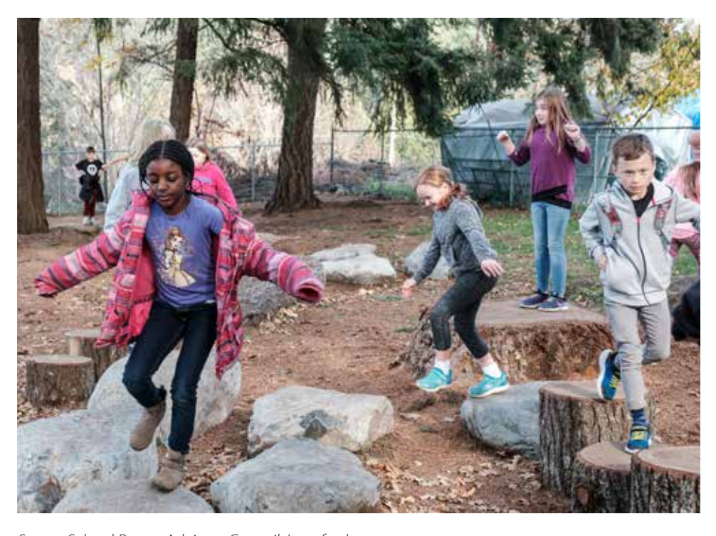
Savory School Parent Advisory Council, Langford.

PRINTE sections of the Computity Gam Agriculture. Program Guide these Archard applicable to extra-provincial non-share corporations on an ongoing basis. Grant funds must remain under the management and control of the governing body specific to B.C.