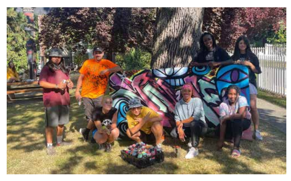
B.C. Black History Awareness Society, Victoria.