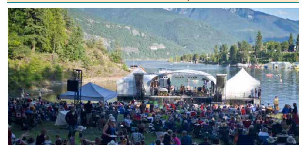
Kaslo Jazz Etc. Society, Kaslo.