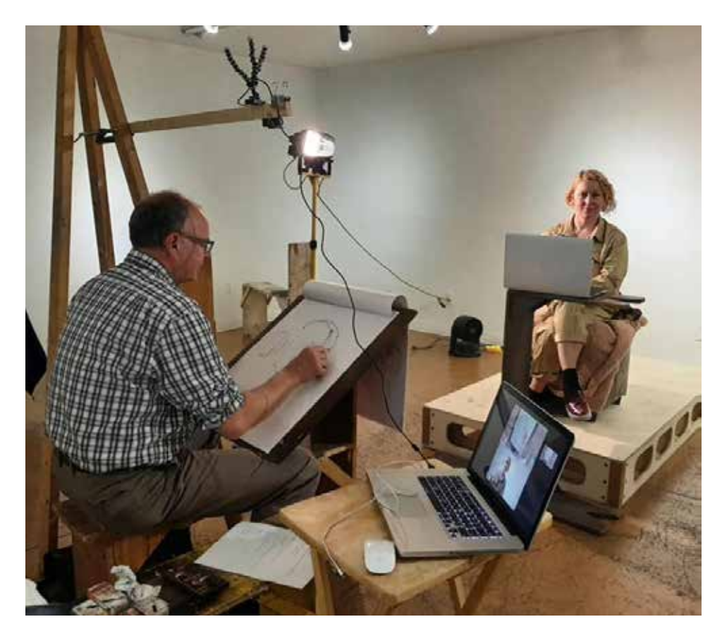
Xchanges Gallery & Studios Society, Victoria.