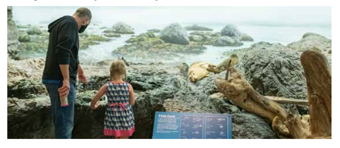
Royal BC Museum, Victoria.

This chapter provides information that applies to all Community Gaming Grant applicants, except Parent Advisory Councils (PACs) and District Parent Advisory Councils (DPACs). Additional information for Service Clubs, the British Columbia Association of Charitable Gaming and Community Charitable Gaming Associations is presented in Chapters Two and Three.