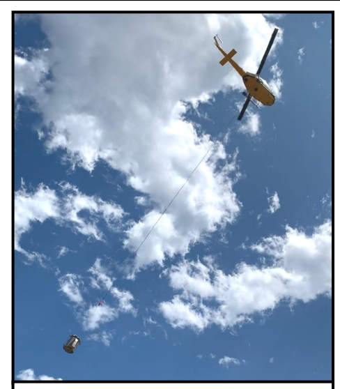
Figure 4. The holding tanks with fish inside, being transported upstream past the partial blockage.