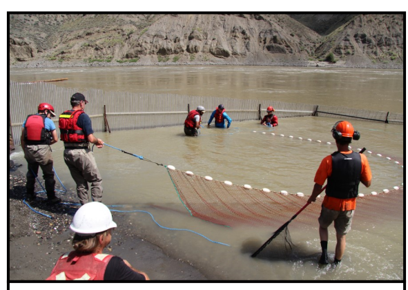
Figure 1. Seining the fish towards the picket weir.