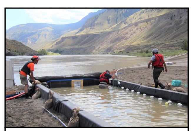
Figure 2. The fish enter through the weir and into the off-channel holding pond.