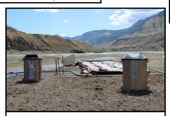
Figure 3. The holding tanks used to transport fish upstream via helicopter.