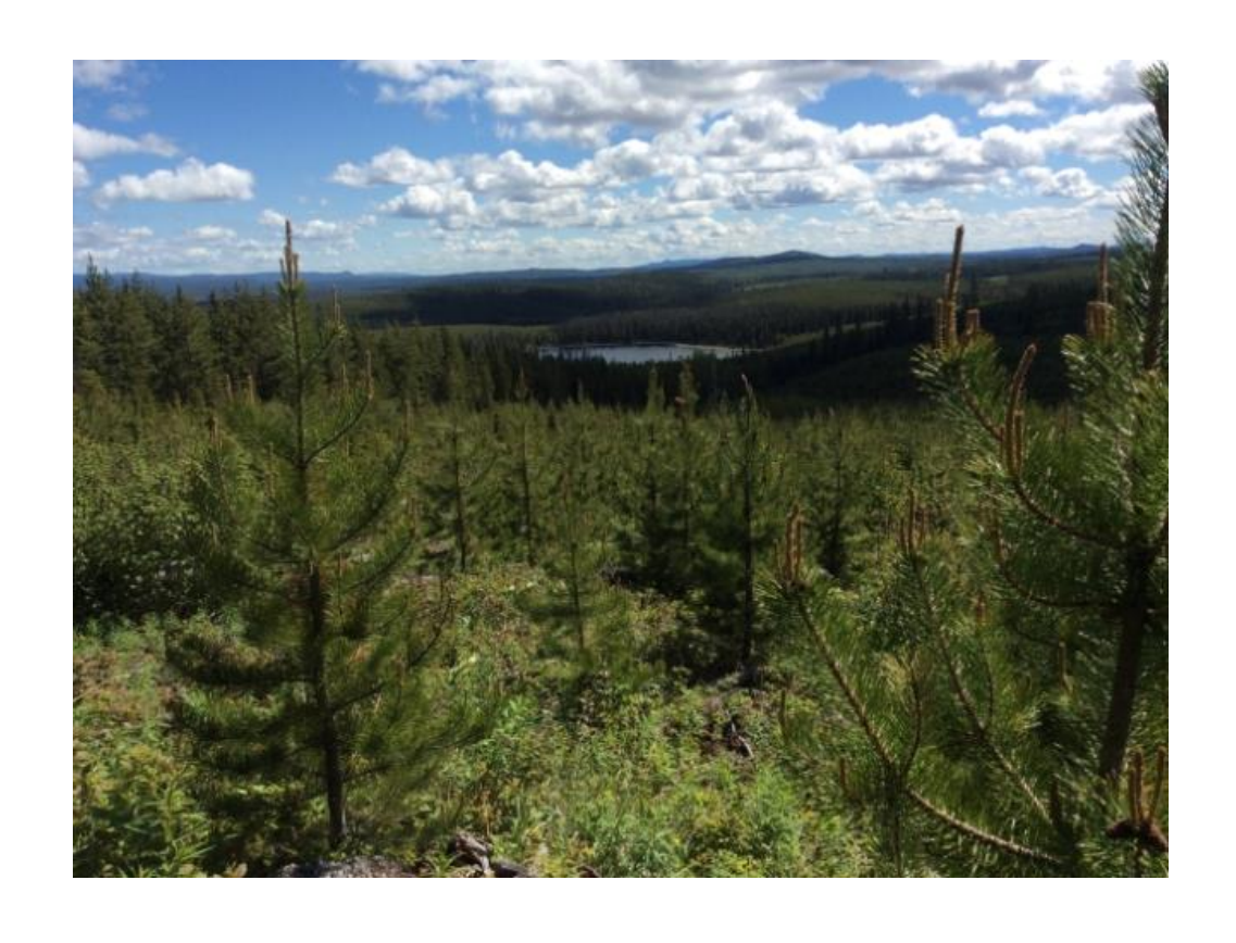
BC TIMBER SALES BUSINESS PLAN 2022/23 – 2024/25 | July 25, 2022