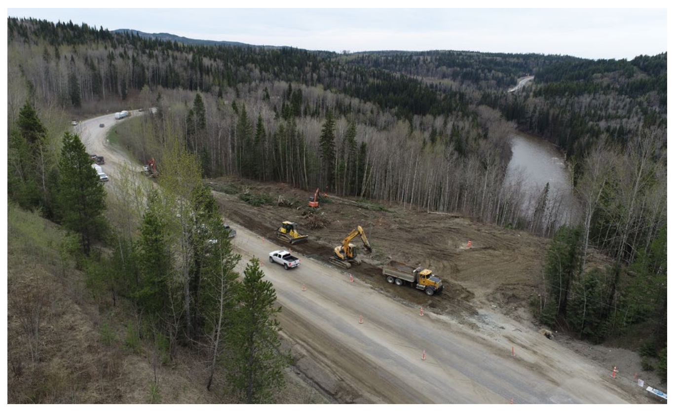
Photo of crest unloading work along Highway 97 at Cottonwood Hill adjacent to the Cottonwood River.

The project, located along a stretch of the Cottonwood River approximately 15 kilometres north of Quesnel, is being designed with a focus on resilience to changing weather patterns to improve the safety, stability and reliability of the road for the long term.