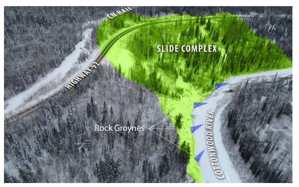
The location of the four groynes installed in the river this fall.

Built with large rock material, groynes redirect river flows away from the slide area.