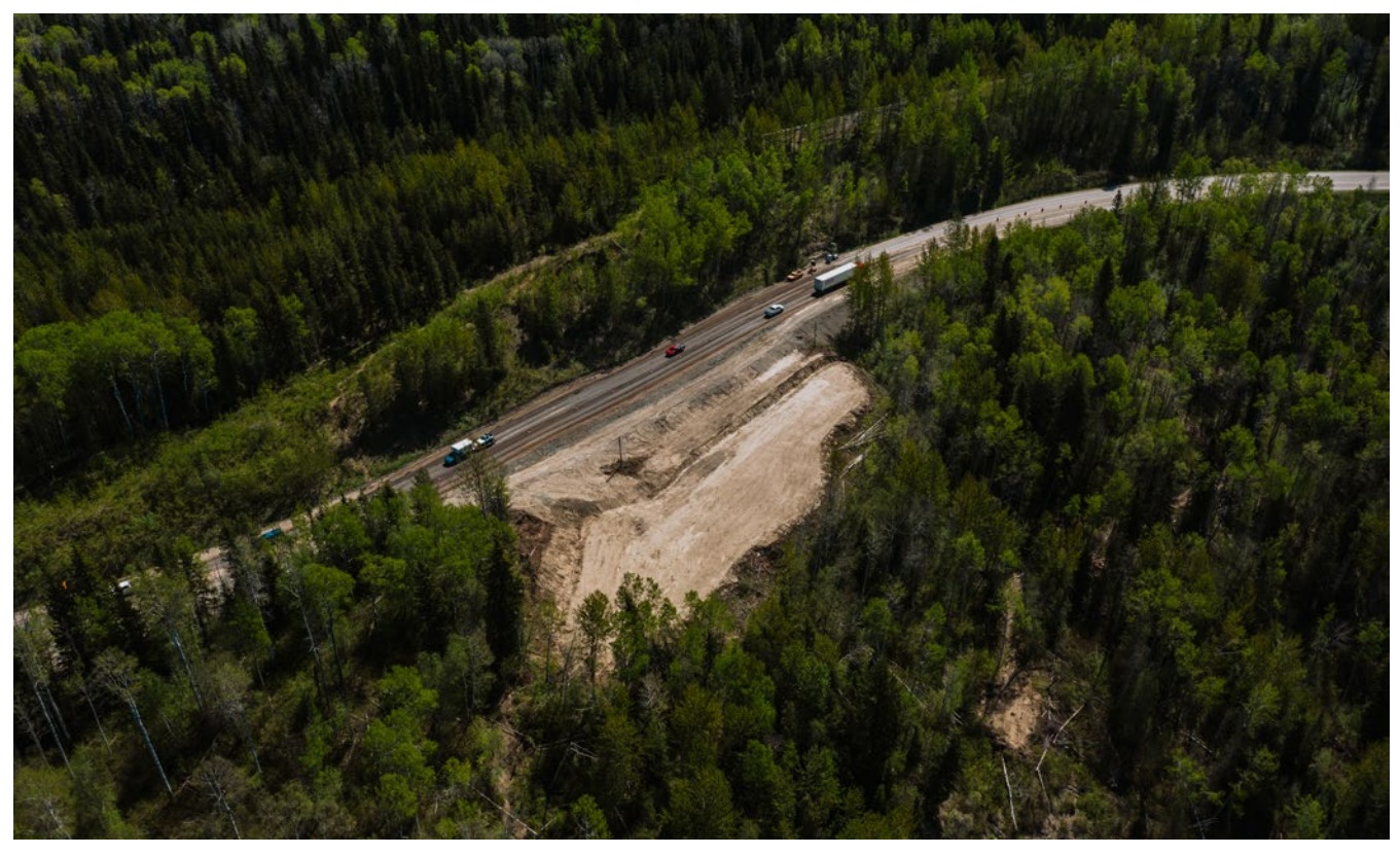
An aerial view of the Highway 97 at Cottonwood Hill Project, where weight was removed from the top of the slide adjacent to the highway.

The Cariboo Road Recovery Projects are restoring access where feasible, benefiting tens of thousands of people who use these affected roads and highways.