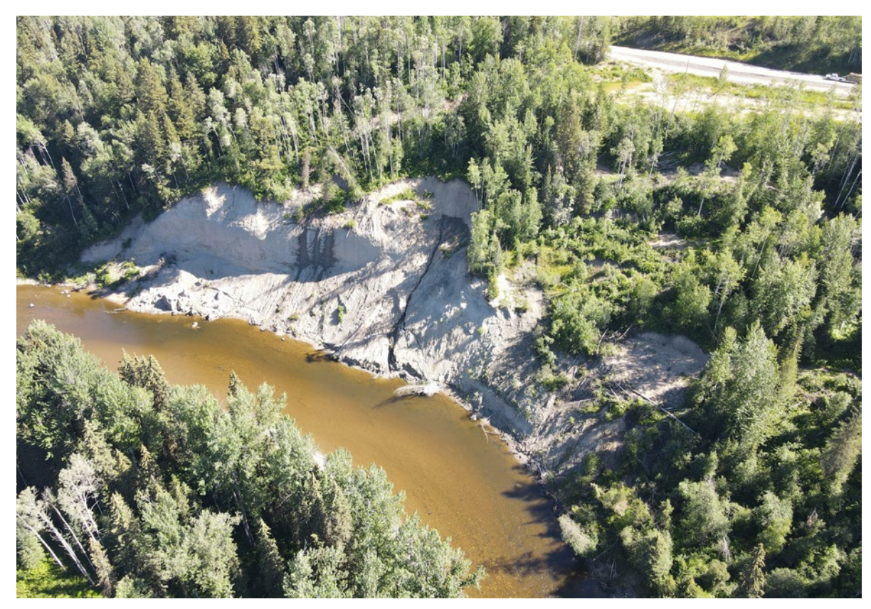
Photo of the embankment to be stabilized along the Cottonwood River.

Environmental assessments are underway for fish species, bird nesting and endangered species and species at risk in the area.