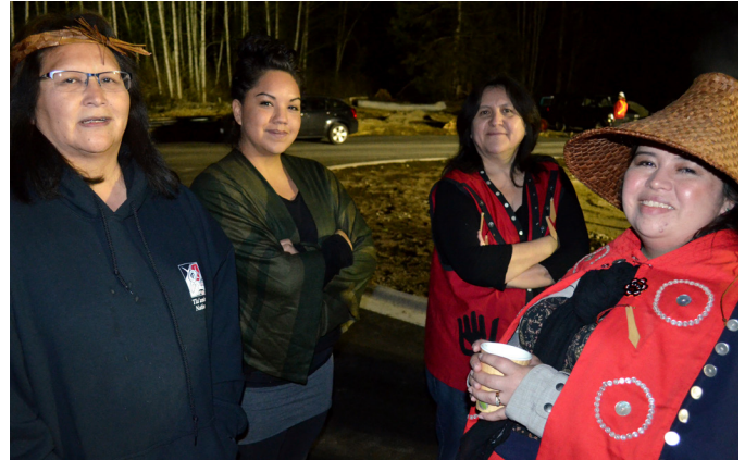
Midnight transition on Effective Date April 5th, 2016.