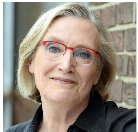
Hon. Carolyn Bennett, M.D., P.C., M.P.

Hon. Carolyn Bennett, M.D., P.C., M.P. Minister of Indigenous and Northern Affairs Canada