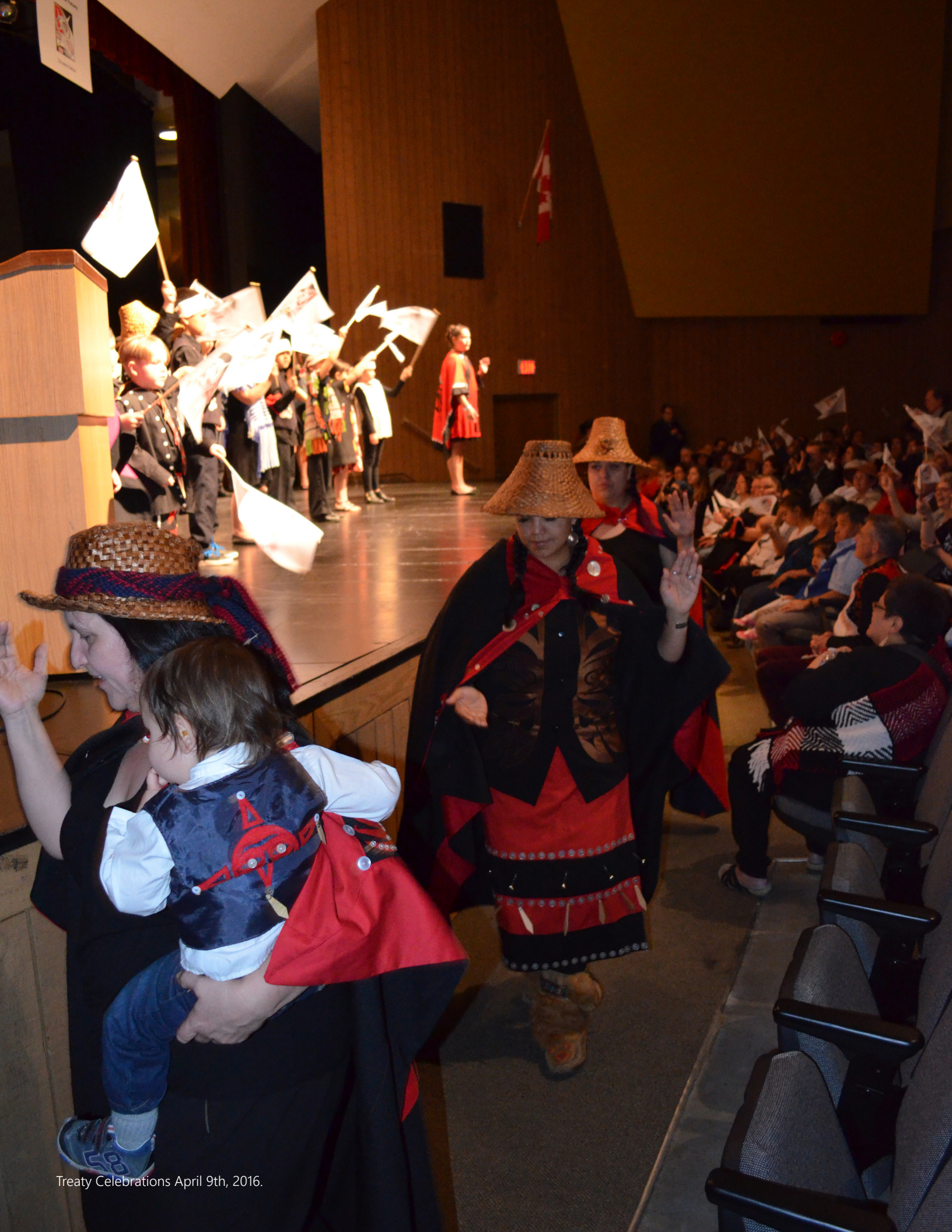
Treaty Celebrations April 9th, 2016.