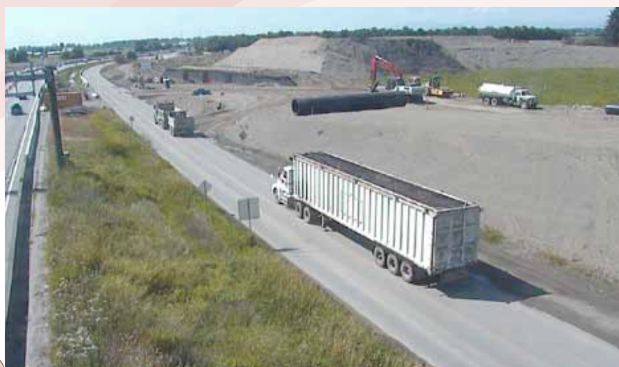
72nd Street at Highway 99 Preload Northeast of Highway 99