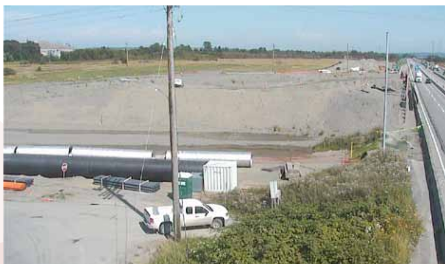
72nd Street at Highway 99 (Southbound)