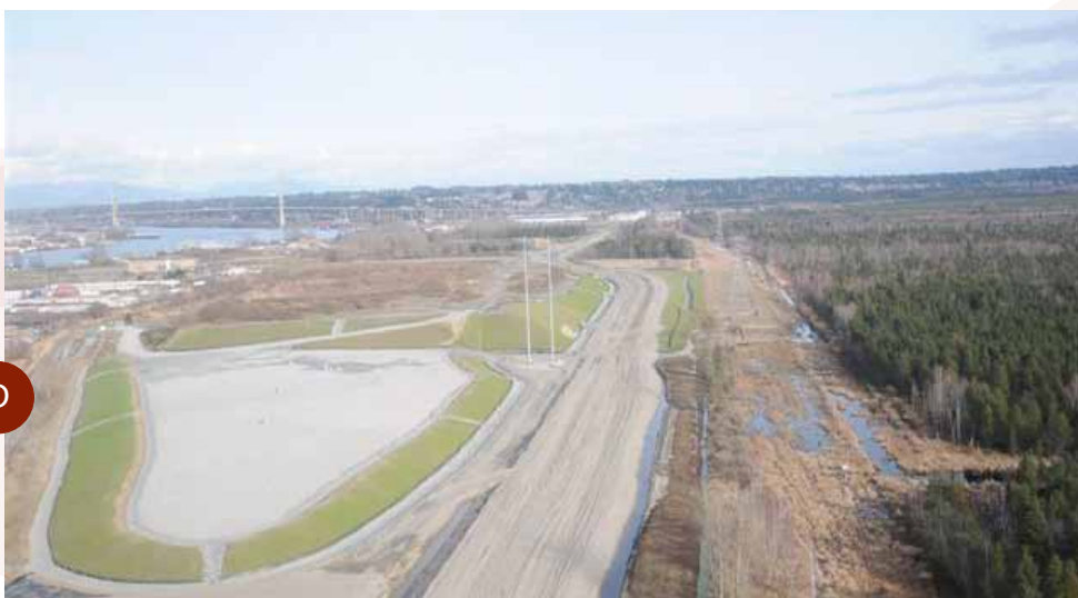
Landfill Closure Project in Delta. Please refer to the map on page 9.