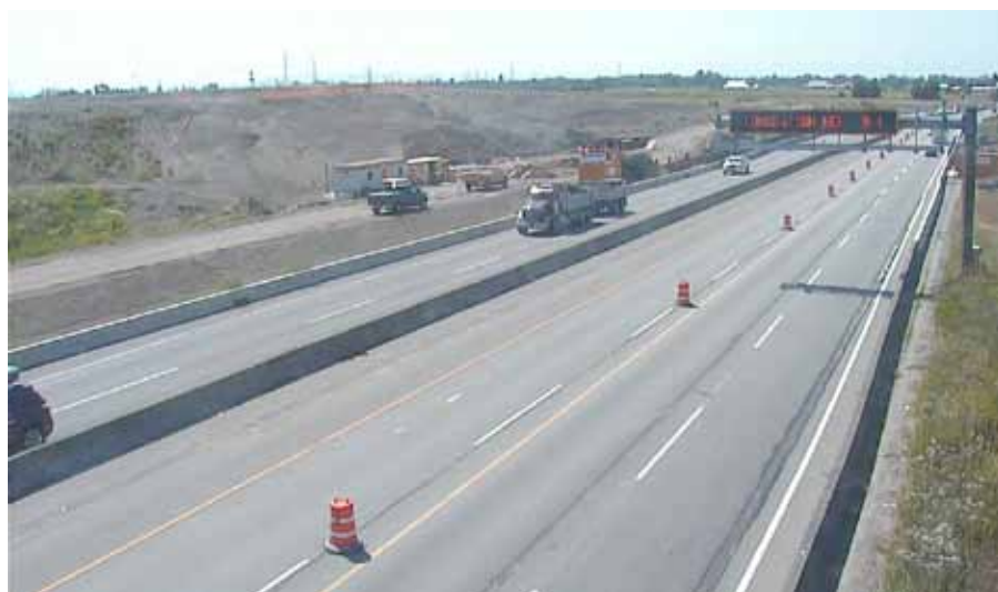
72nd Street at Highway 99 (Northbound)

The following photographs provide a context to the Project to the end of the 2011/12 Fiscal Year