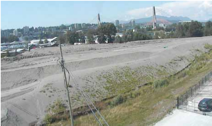
Tannery Road Preload East of Tannery