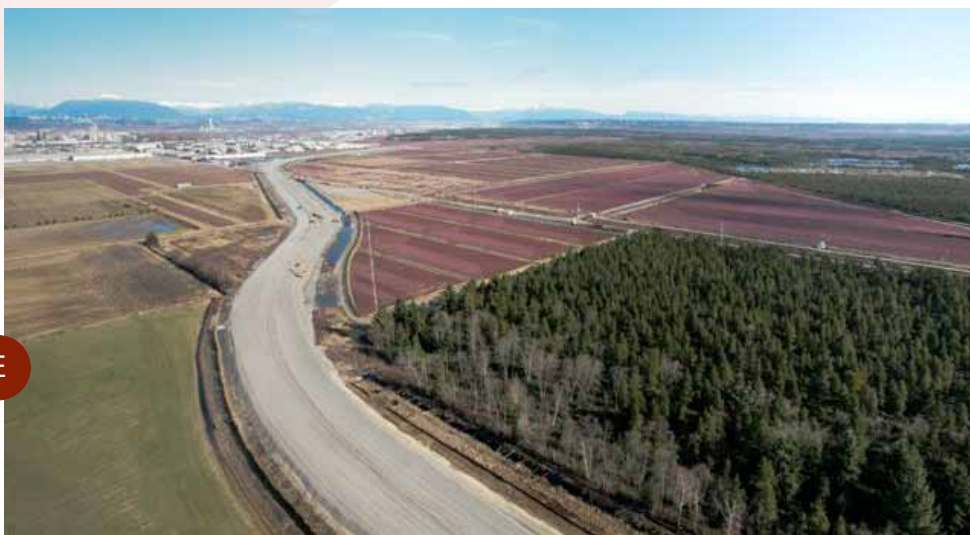
SFPR in Delta. Please refer to the map on page 9.