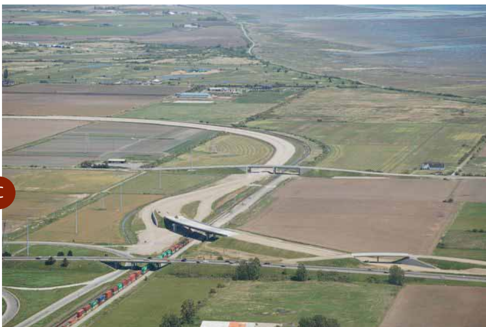
SFPR and the Highway 17 interchange in Delta, with the 64th Avenue overpass behind. Please refer to the map on page 9.