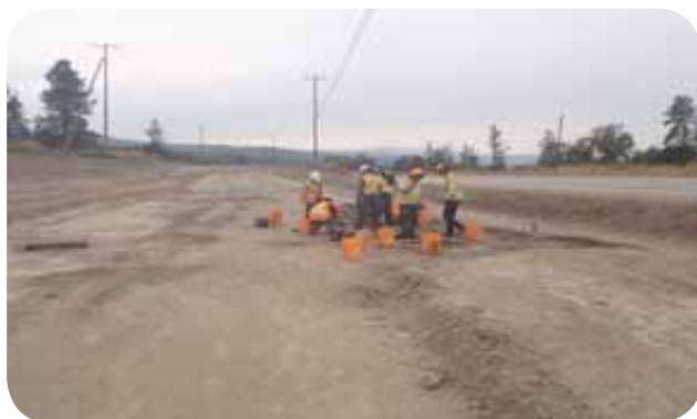
Significant Archaeological find.