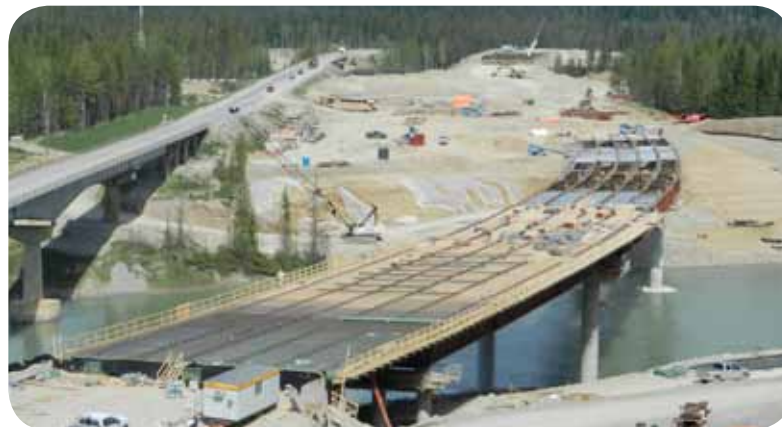
May 26, 2012 (one year later)