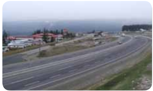
Phase 3 West after

The final construction activity of Phase 3 West is a retaining wall structure at the eastern end of the project. A Major Works contract for the Kilometre 4 Wall and Approaches was tendered and awarded to Tercon Construction Ltd. on