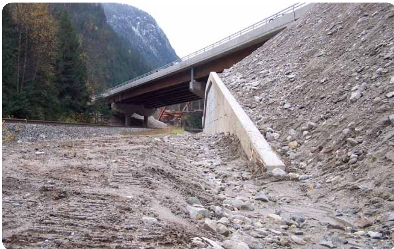
Completed by the rails