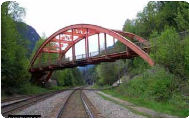
Overhead West Approach