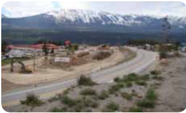
Phase 3 West before

mitigation works from the entrance to the steep canyon sections through to the intersection with Highway 95.