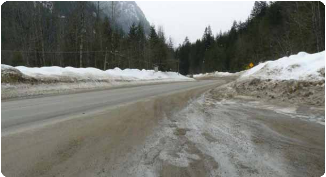
Tonkawatla Pullout looking east