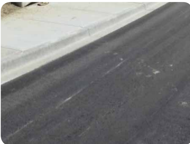
Nancee Way opens to public traffic at 11:30 a.m.; April 20, 2013