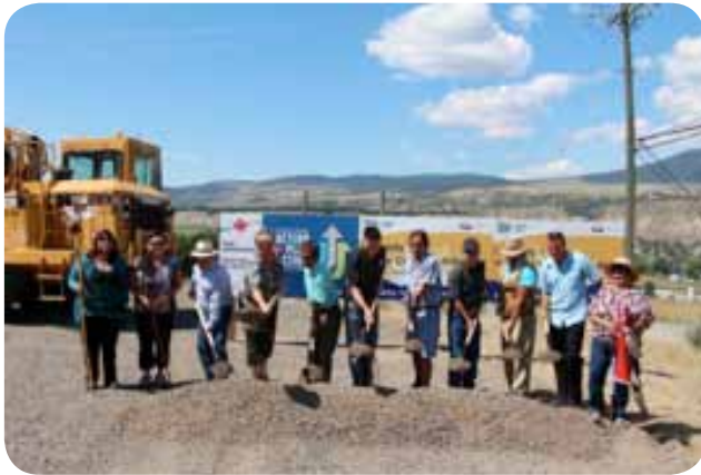
Groundbreaking event – July 29, 2013.

This project entails upgrading 6.1 kilometres of Highway 1 between Pritchard to Hoffman's Bluff, including Hoffman's Bluff itself, to a four-lane, 100 km/h design standard, including access management and frontage roads.