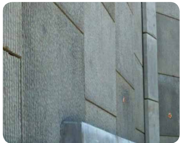
MSE Wall A repairs now completed and backfilled; April 22, 2013