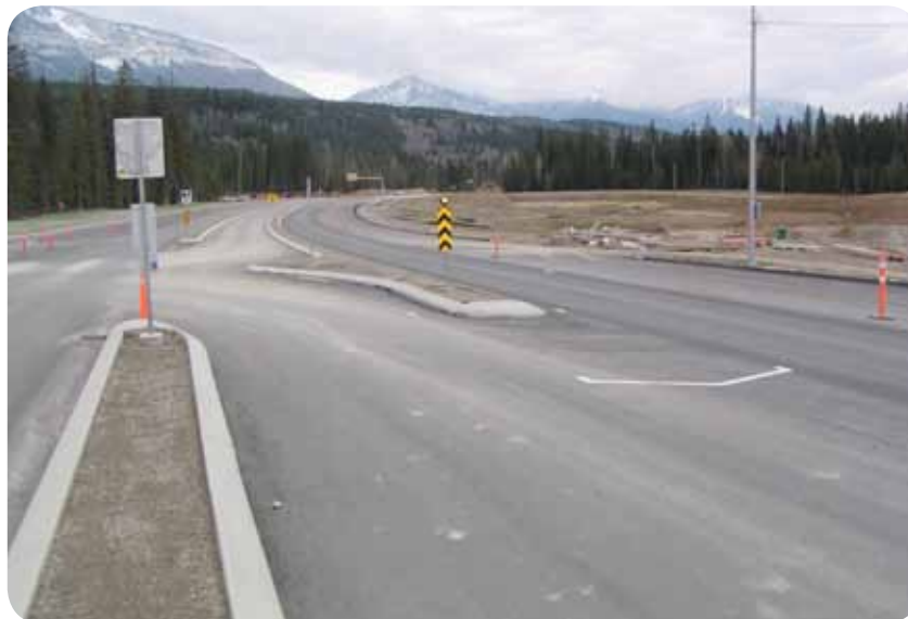
Donald Intersection Upon Completion