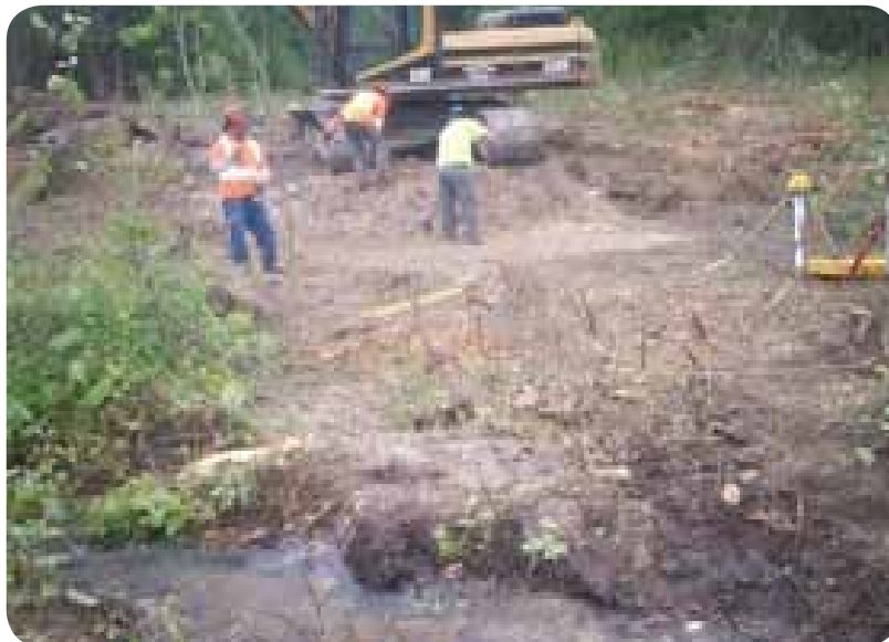
Crew prepping for temporary crossing at Harper Creek.