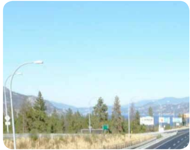
Highway 97 north of WR Underpass paving, barriers, lines complete Oct 2012