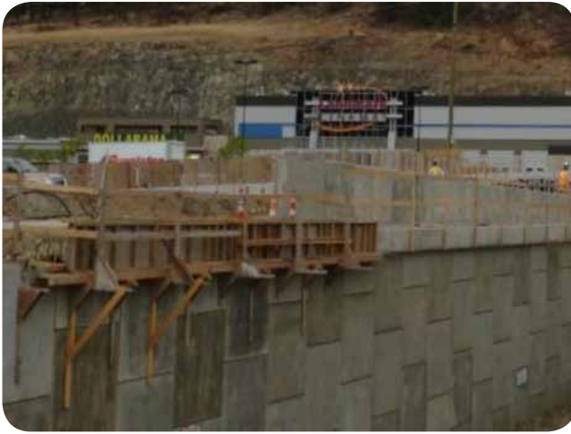
Nancee girder installation underway Sept 25 2012