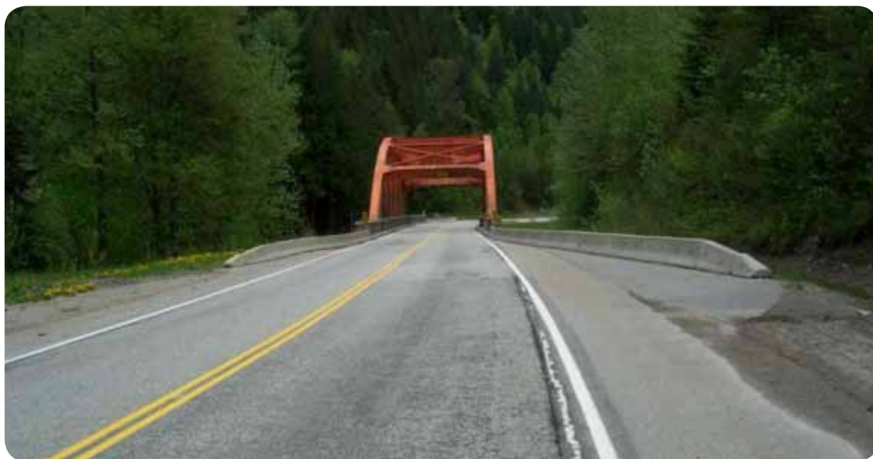
Overhead from side looking West