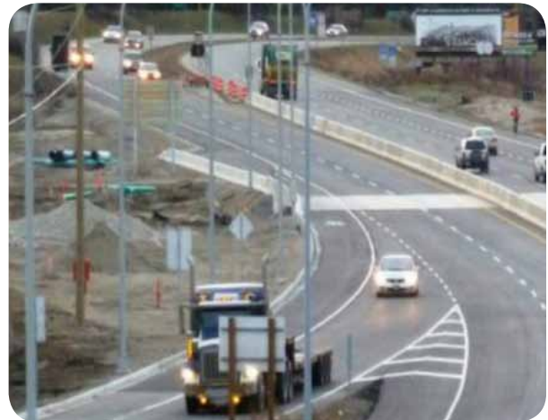
Highway 97 barriers installed, line painting completed Dec 06 2012. (Nancee Way Overpass shown at top third of photo)