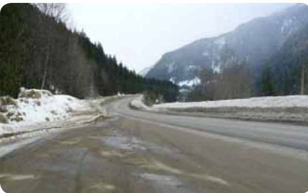
West end looking east