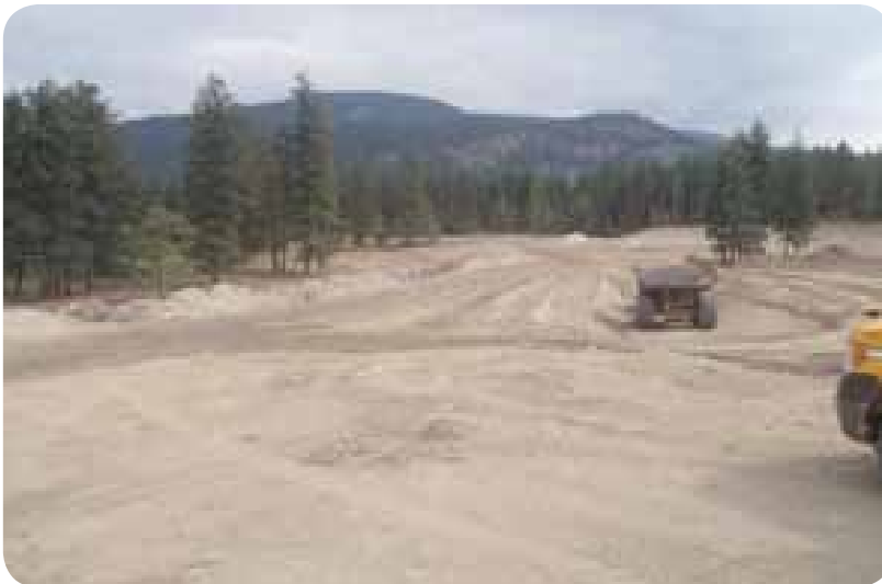
Construction of 200 line (side road) looking south.