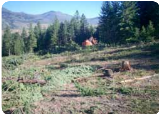
Clearing for side road.