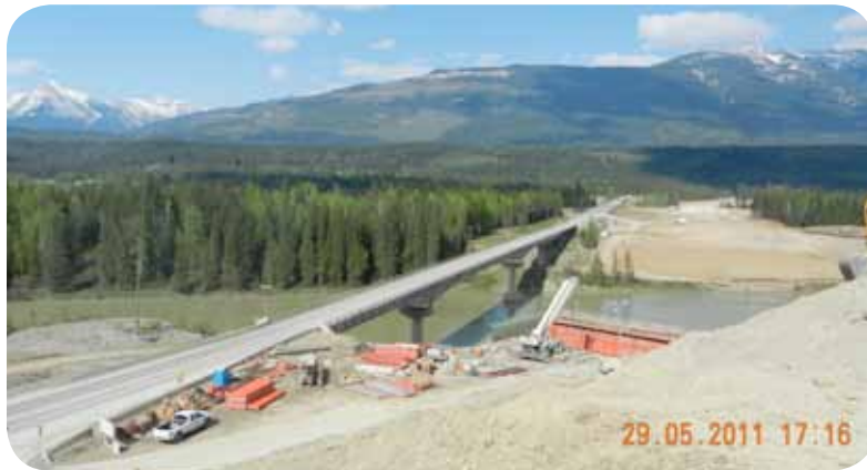
May 29, 2011