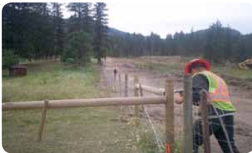
New fence construction ongoing.