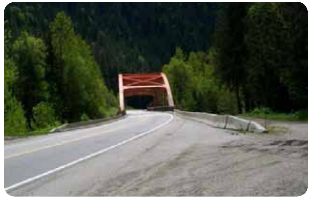
Tonkawatla Looking West