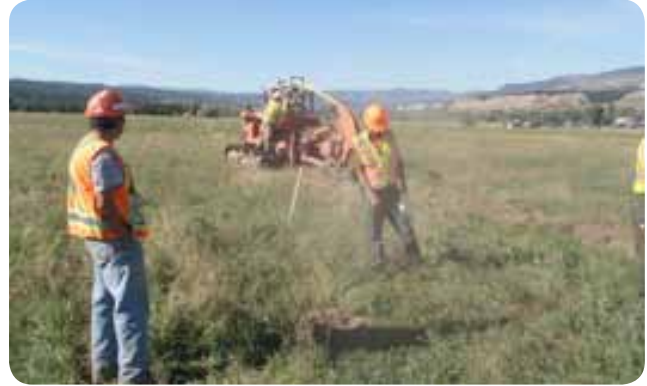
Gas Line Relocation