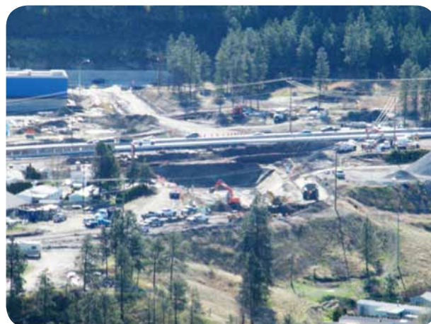
Aerial view of Nancee Way Overpass construction – April 18, 2012

The following photographs are of the project during construction and substantial completion: