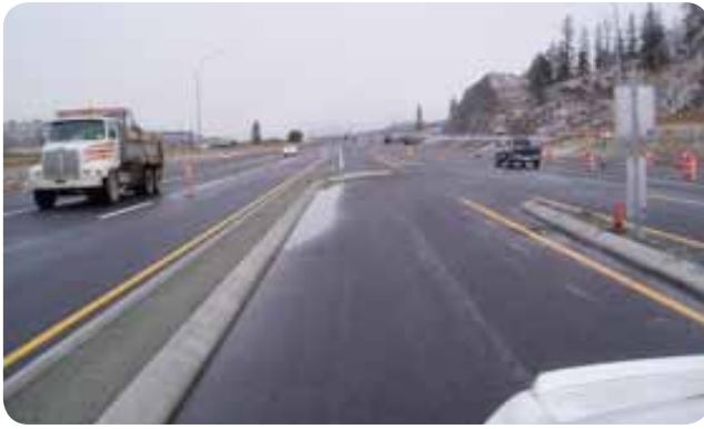
Monte Creek Phase 1