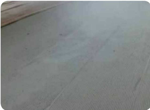
Nancee deck, placing completed, curing operations underway Oct 15 2012