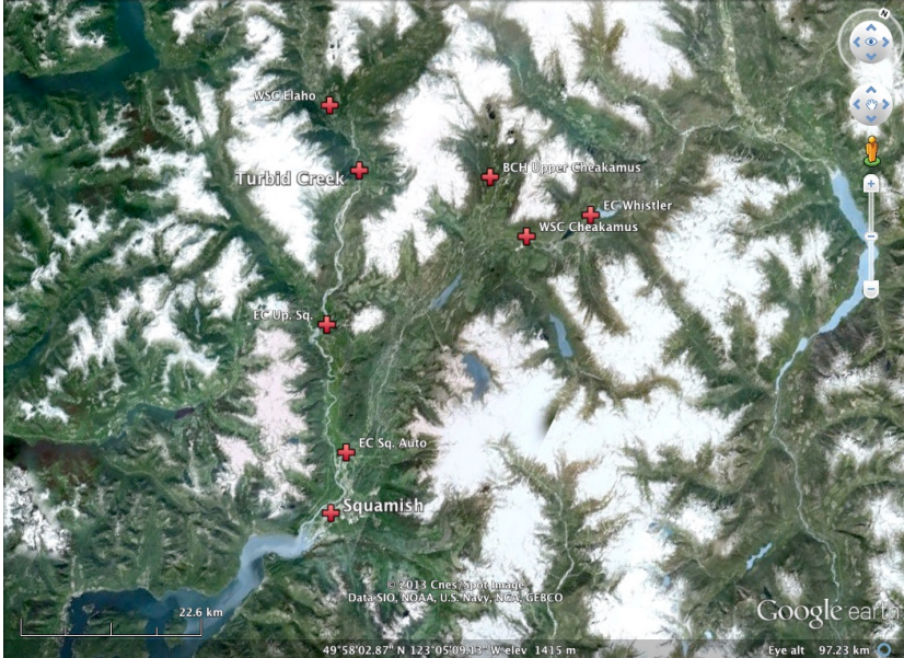
Figure 1. Location of Turbid Creek north of Squamish. Nearby climate stations and stream gauging stations are shown. EC, Environment Canada; BCH, BC Hydro; WSC, Water Survey Canada.

The purpose of this report is to characterise weather conditions that have resulted in landslide activity on the west side of Mount Cayley, and develop landslide warning criteria. A suite of measures are recommended that could be used to manage landslide risk before an event and during crossing reconstruction. This report recommends various risk management strategies; but the ultimate strategy will be determined by MoFLNRO.