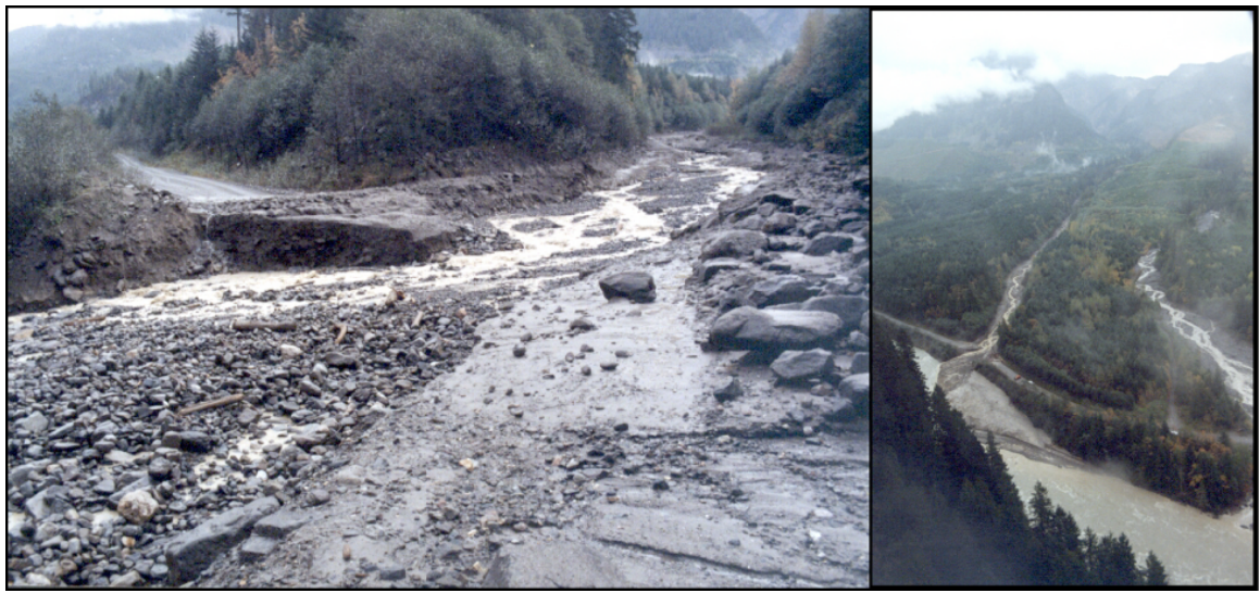
Figure 3. Washout at Turbid Creek in 1997. Exact date of occurrence unknown (from photos on file with Friele). Note this is a typical small, channelised event; it destroyed the crossing and filled Squamish River with debris, and may have briefly dammed the river.