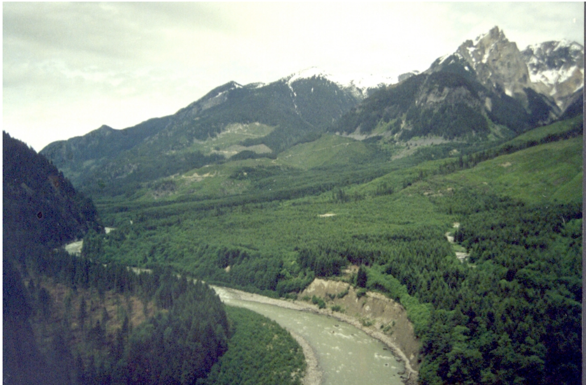
Figure 2. View north up Squamish River to Mount Cayley. The river cutbank exposes a 14 m thick sequence of landslide materials deposited primarily by the 4800 year old landslide (Evans and Brooks 1991).