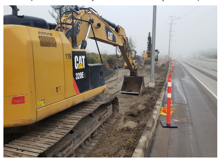
S3 (Hwy 91C/C01 Detour South): Embankment fill placement ongoing during night shift. Taken September 16, 2020