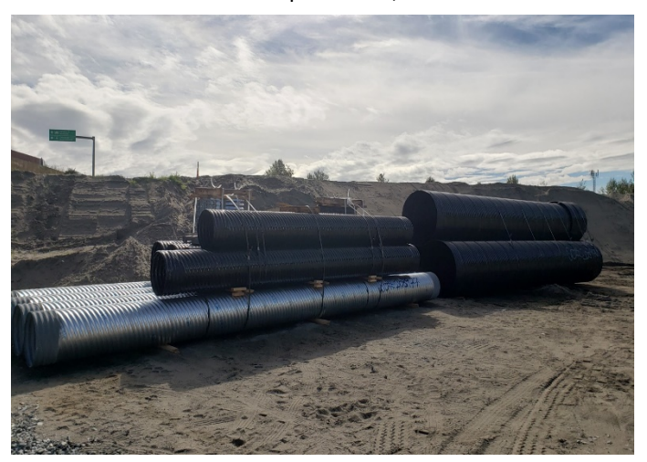
S1 (River Rd West Roundabout): Several sizes, and variations of CSP culverts have arrived. Taken September 22, 2020