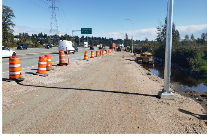
S2/S3 (Hwy 91C/C01 Detour South): The road widening construction has reached the top of the road base gravel layer Taken September 25, 2020