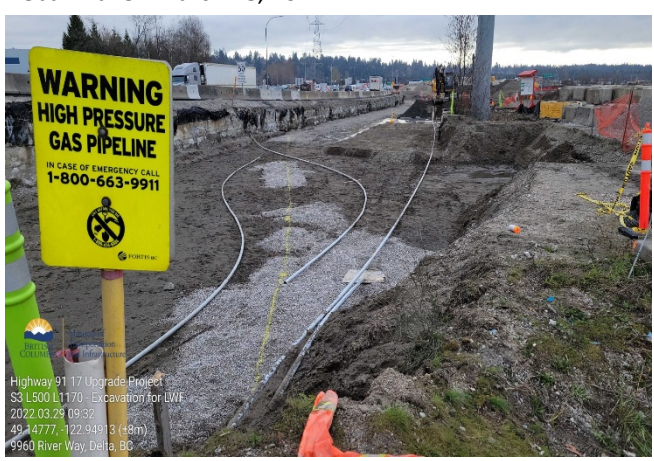
S3 – Excavation for LWF. Taken March 29, 2022