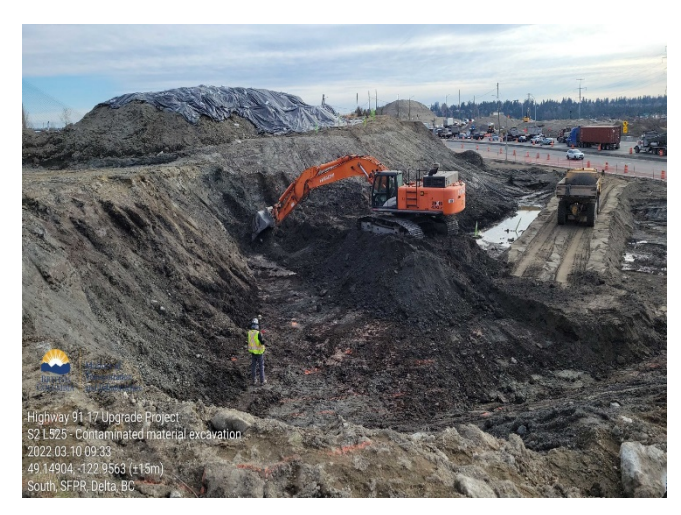
S2 – Contaminated material excavation. Taken March 10, 2022