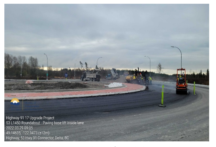
S3 – Roundabout paving base lift inside lane. Taken March 29, 2022