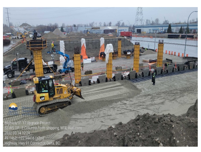
S3 – Westside overpass E columns form stripping; MSE walls construction. Taken March 14, 2022