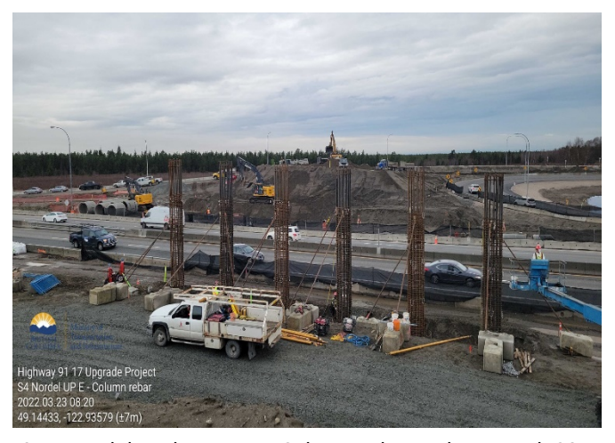
S4 – Nordel Underpass E – Column rebar. Taken March 23, 2022