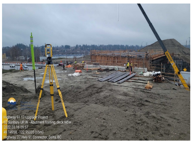
S2 – Sunbury Underpass West – Abutment footing, deck rebar. Taken March 18, 2022