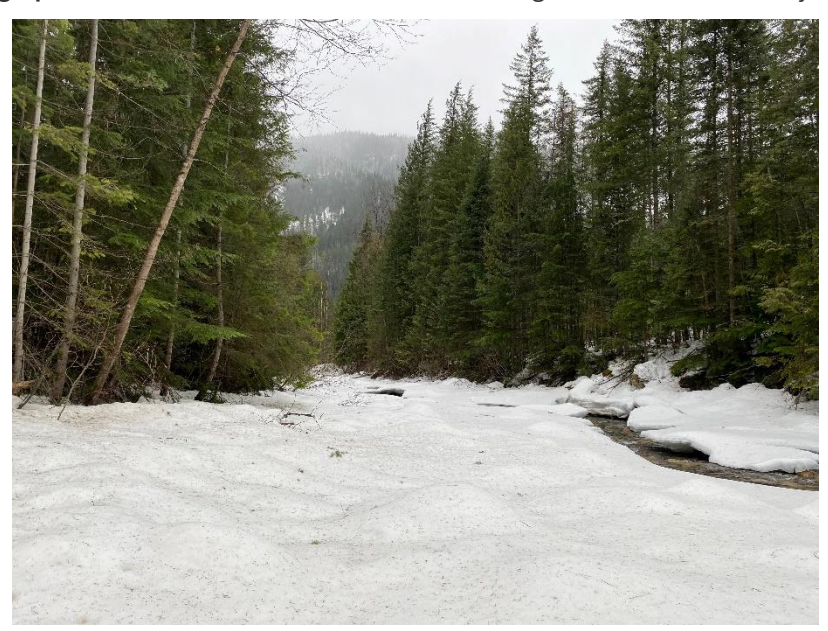
Photograph 5 View of the mature mixed forest vegetation below the Project area.