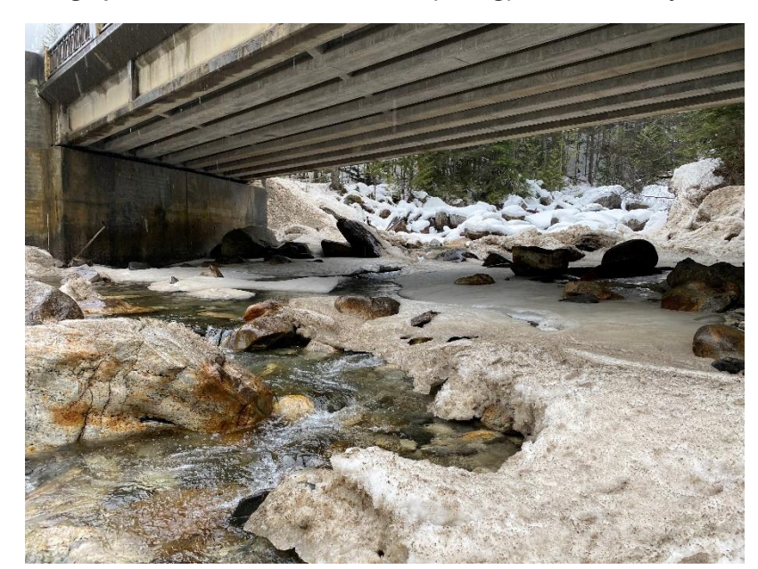
Photograph 3 View of the channel morphology within the Project area.