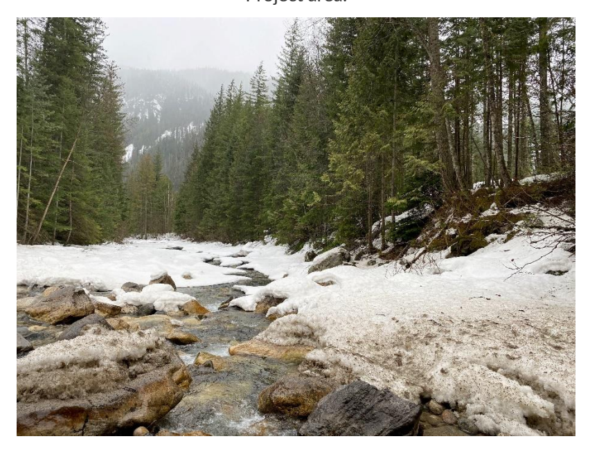
Photograph 4 View of the riparian vegetation and channel morphology downstream of the Project area.