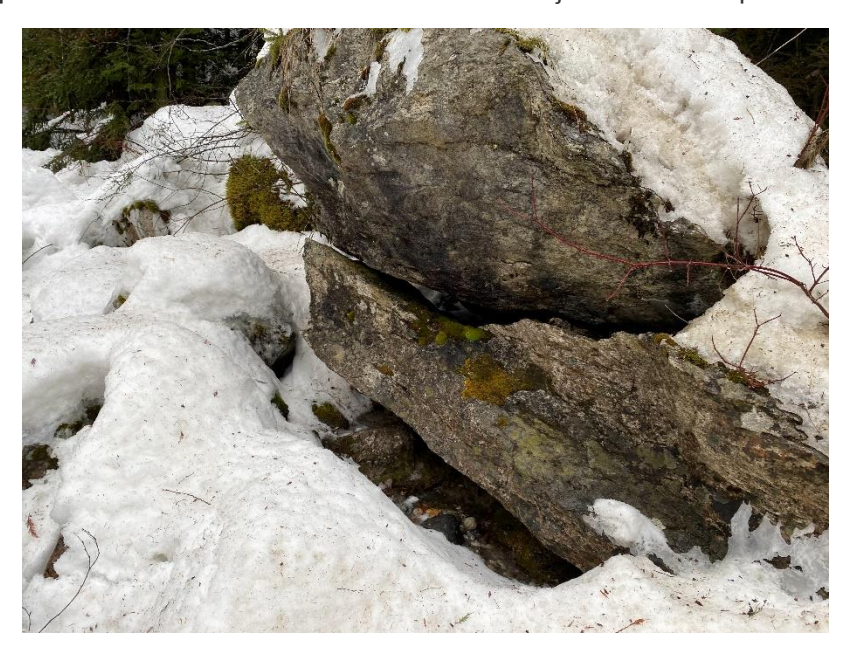
Photograph 6 Suitable terrestrial habitat within the Project area for amphibian and reptile.