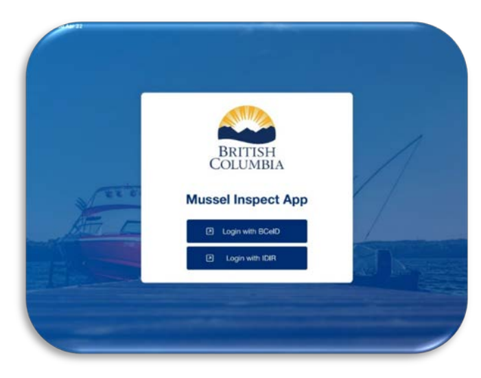
New internal watercraft Inspect App was launched for the 2020 season. It was developed under the broader Species and Ecosystems Information Systems Modernization (SEISM) Capital Project.

AlS Inspectors were also utilized from April 13, 2020 to June 20, 2020 to perform COVID 19 screening at various US/Canada border ports of entry as part of the Province's strategy to educate the public and ensure compliance with the Federal Quarantine Act, ensuring that travelers were completing their self-isolation compliance forms. AlS staff were instrumental assisting in this capacity and enjoyed the opportunity to work with full time Conservation Officers at the borders.