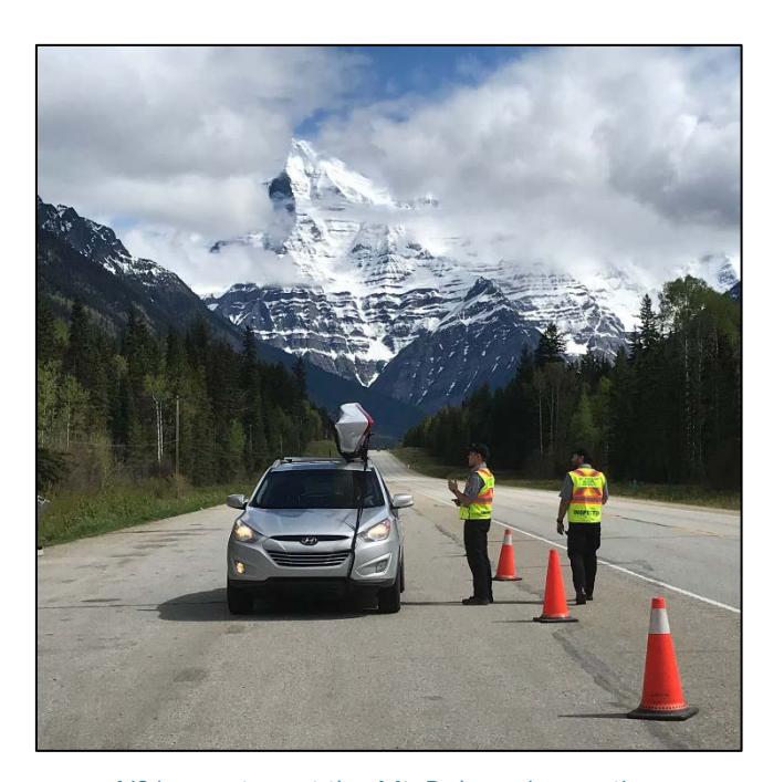
AlS inspectors at the Mt. Robson inspection station.

Of the 29,900 inspections performed, 16 watercraft were confirmed to have adult invasive mussels. These watercraft came from Ontario (12), Arkansas (2), Wisconsin (1) and Manitoba (1) and were destined for the Okanagan (7), Lower Mainland (3), Vancouver Island (3), Thompson-Nicola (2), and unknown (1). The Program received advanced notification on 13 of the 16 mussel fouled boats either from another jurisdiction (e.g., AB, MT, ID, WA) or by Canada Border Services Agents (CBSA).