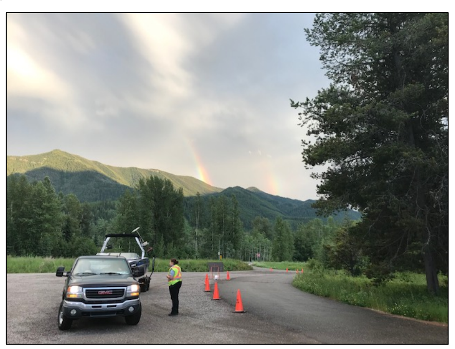
AlS inspector at the Olsen Inspection station on Hwy 3, a highlight of the job during what was a challenging and unique season.