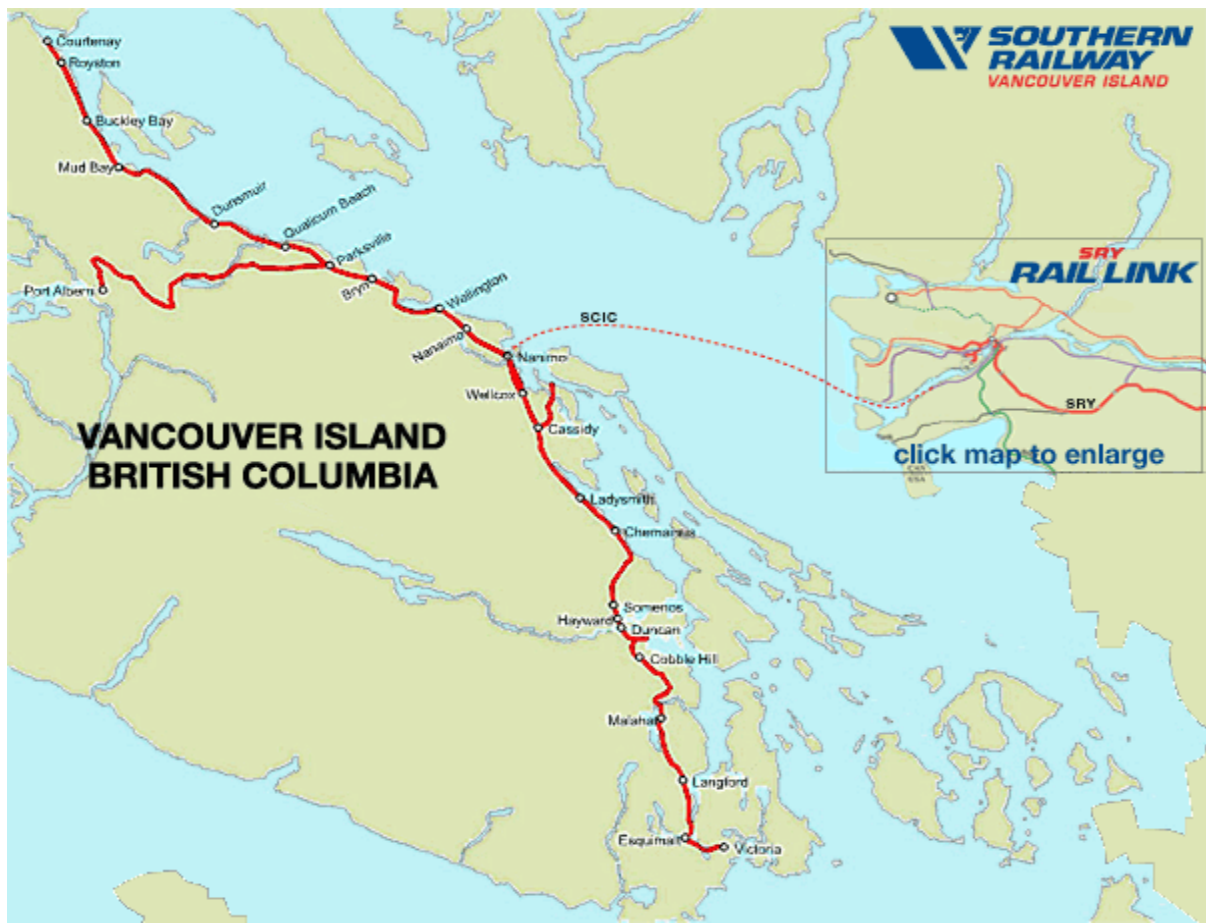
*Excerpted from <a href="http://www.sryraillink.com/about/vancouver-isl-map.html">http://www.sryraillink.com/about/vancouver-isl-map.html</a>

SVI (on behalf of VIA Rail Canada) runs regular passenger train service (return) with rail diesel cars from Victoria to Courtenay. The train has scheduled stops at Duncan, Nanaimo, and Parksville, with many other flag stops (stops on request) along the way. SVI operates two Subdivisions and one Spur: the Port Alberni Subdivision (60 km); the Victoria Subdivision (225 km) and the Wellcox spur (5 km). SVI currently connects with CPR via rail barge between Nanaimo and Tilbury and interchanges with four North American Class One (CPR, CN, BNSF and UP) railways at six locations.