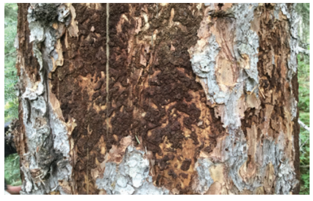
Figure 7. Spruce beetle galleries under the bark, indicating that the tree is infested and should be removed from the property to minimize the chances of the beetles spreading to other nearby trees the following year.