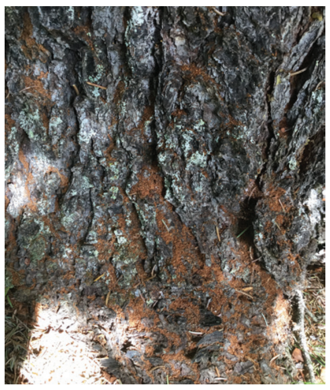
Figure 3. Frass (fine sawdust) on a tree trunk, an indication that beetles have bored into the tree.