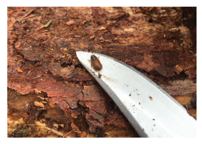
Figure 1. Adult spruce beetles are black-red in colour. Their size ranges from 4 to 7 mm long (about the size of a grain of rice).

Spruce beetle outbreaks typically last five years or more and they have killed extensive stands of spruce in B.C. in the past. Outbreaks often occur when beetle populations increase in downed material (such as "blowdown" trees). The beetles