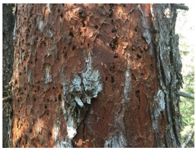
Figure 6. Damage caused by woodpeckers feeding on trees that have been attacked by spruce beetles.