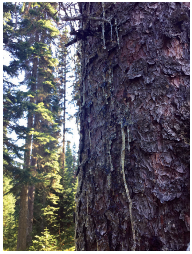
Figure 5. Streaming resin on a tree trunk.