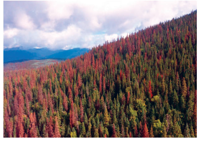
Figure 2. A forested area that's been attacked by spruce beetles.

In the first year after spruce beetles infest a tree (referred to as a "current" attack) the tree's foliage may show signs of discolouration (Figure 2). The needles change from green to a pale yellow-green one to two years after the initial attack. After a couple of years, the needles usually turn red-brown and fall to the ground.