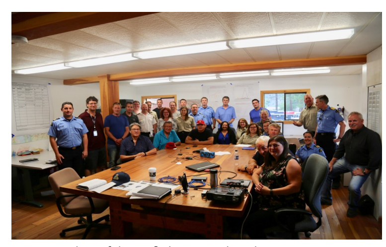
Members of the Unified Command Incident Management team debrief at the incident command post in Lillooet.

The team is currently based out of the Lillooet Fire Zone offices where an incident command post has been strategically placed for proximity to the incident. Currently, there are approximately 100 personnel on site, including individuals contracted from various agencies.