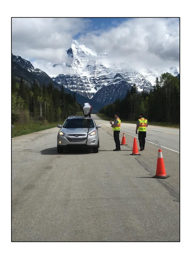
Spectacular views from the Mt. Robson inspection station on Hwy 16 (above) and below is a comparison of watercraft inspection totals as of late July for the 2019 and 2020 seasons.