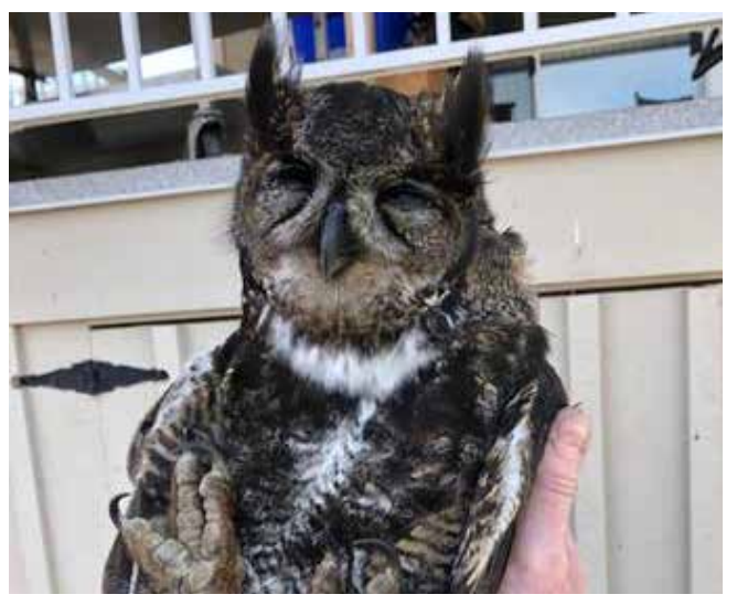
In 2020, this great horned owl died after eating poisoned rodents near Victoria, B.C..