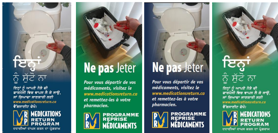
Table 3 Multilingual bookmarks