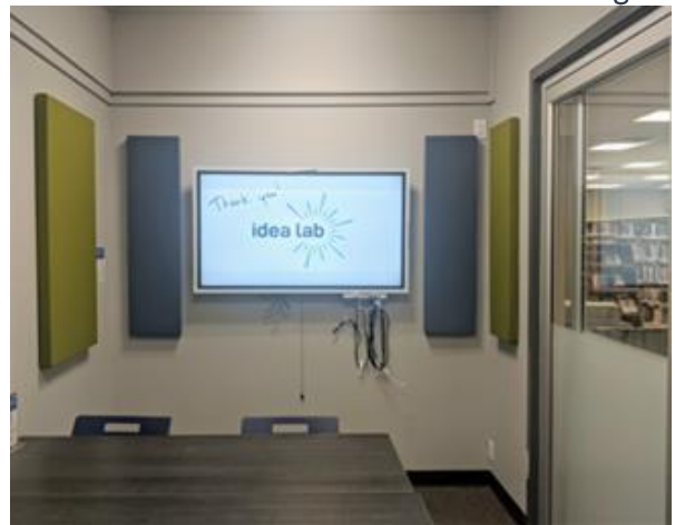
Inside the Idea Lab.