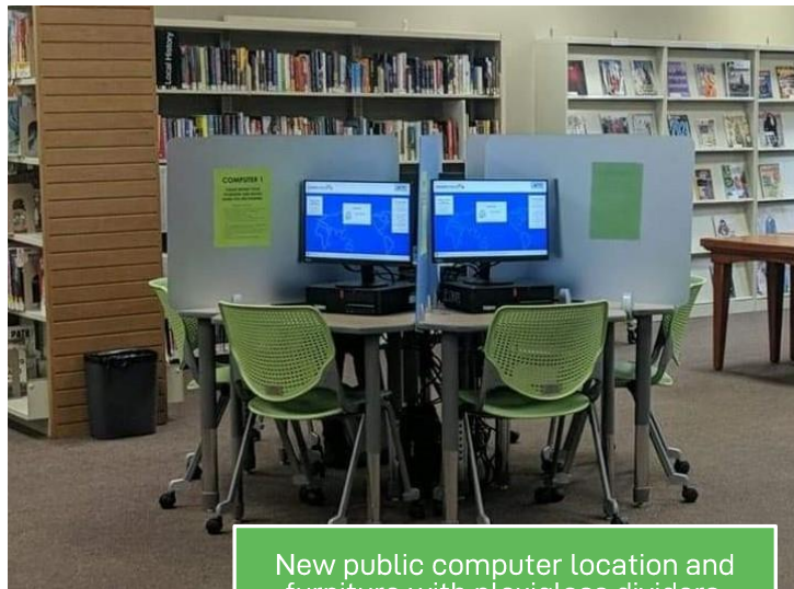
New public computer location and furniture with plexiglass dividers.