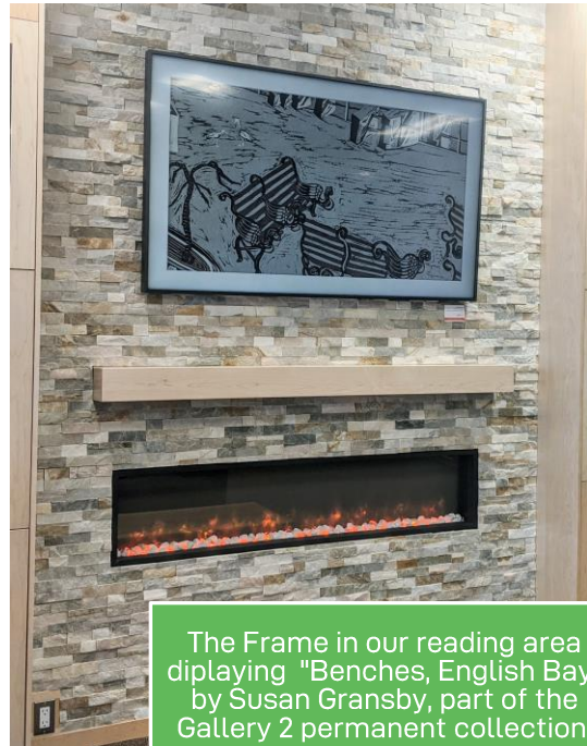
The Frame in our reading area displaying "Benches, English Bay" by Susan Gransby, part of the Gallery 2 permanent collection.