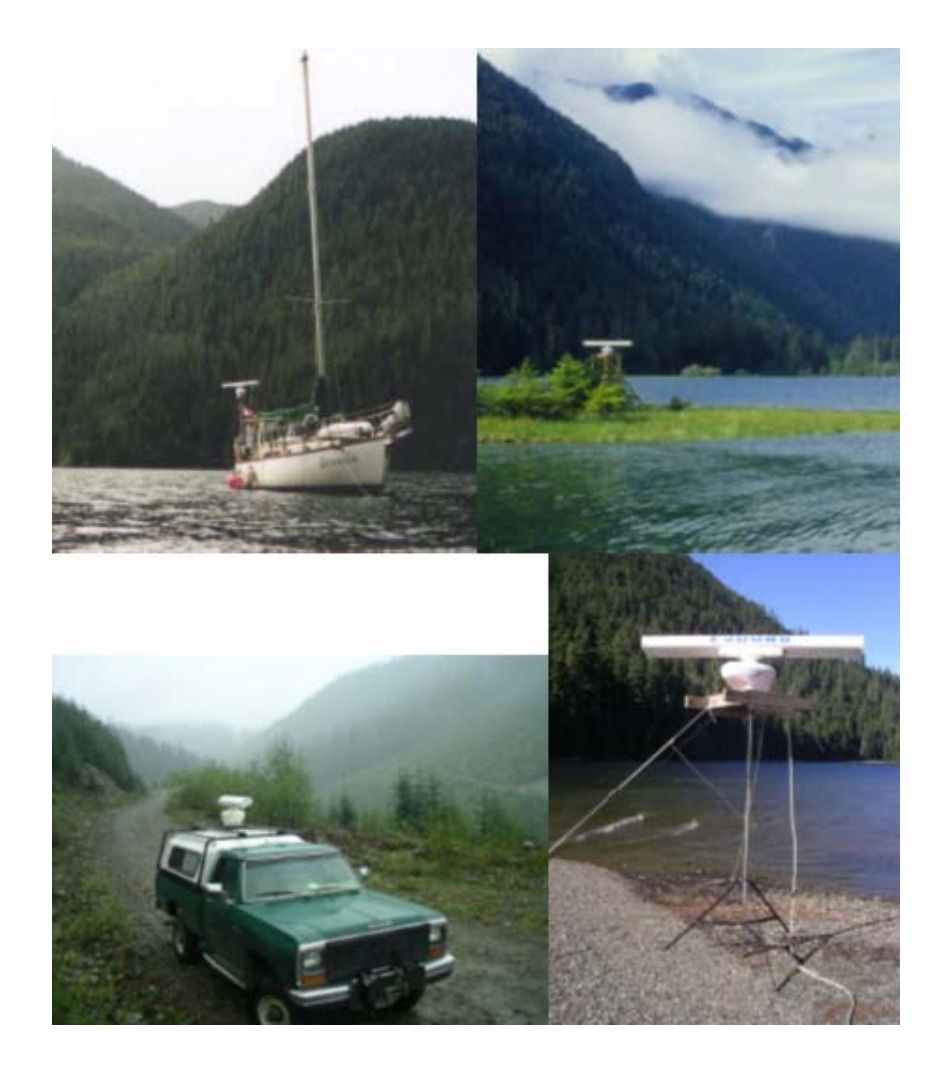
Figure 2. Boat, vehicle and land-based radar set-ups.

construct a raised platform to mount the radar 2.0 to 2.5 m above the ground (Burger 1997). More recently, a system using speaker tripods has been employed to securely elevate the radar above ground (Figure 2, Schroeder pers. comm.). Although the radar unit (scanner and encased motor) is weatherproof, the monitor needs protection from the elements. It should be transported in a watertight container and operated from inside a tent or vehicle.