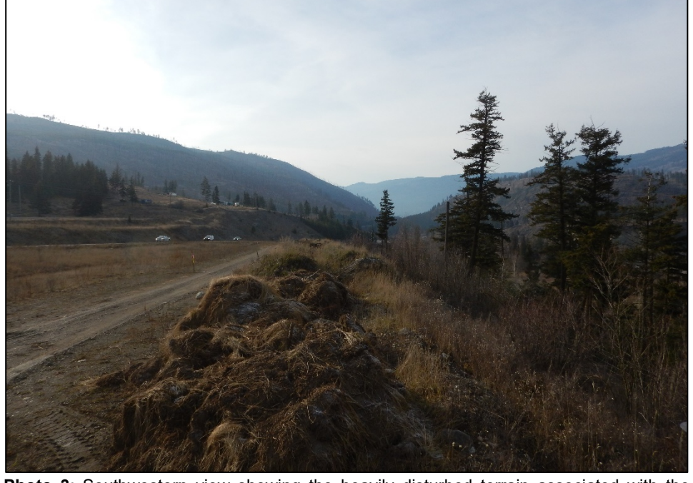
Photo 3: Southwestern view showing the heavily disturbed terrain associated with the proposed CVSE pullout. Stockpiled sediments and debris can be seen center frame.