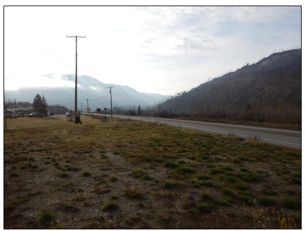
Photo 6: Southern view showing the elevated and elongated feature associated with AAP 8. Exposed gravels and heavily disturbed terrain were observed in this area.