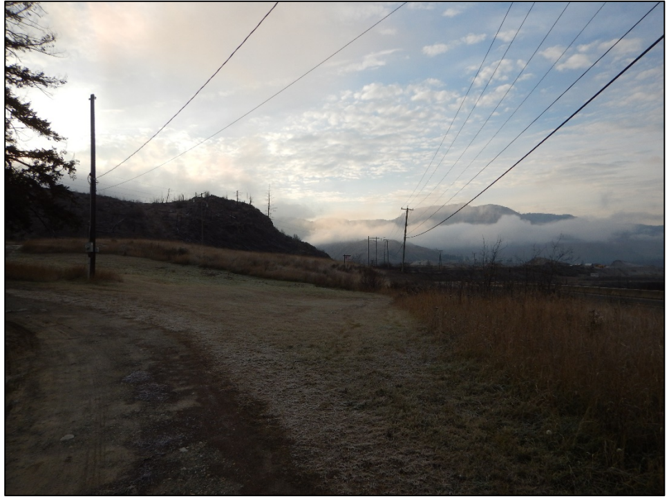
Photo 4: South-southeastern view showing the flat, relatively level terrain associated with AAP 2. Residential development has caused minor impacts to the feature.