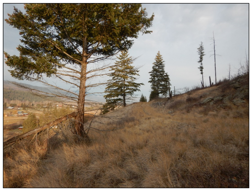
Photo 5: North-northwestern view of AAP 4 showing the flat to gently sloping terrain associated terrace.