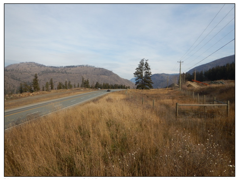
Photo 7 : Northeastern view of AAP 9 showing the remnant landform associated with a glacial feature. A fence line bounds the feature to the east and highway development has impacted the western margin of the feature.

Project Number: TCS18-0024-002 February 7, 2019