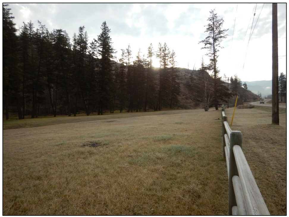
Photo 1: South-southeastern view showing the flat, level, and terraced terrain associated with AAP 5 and the northern portion of the study area.