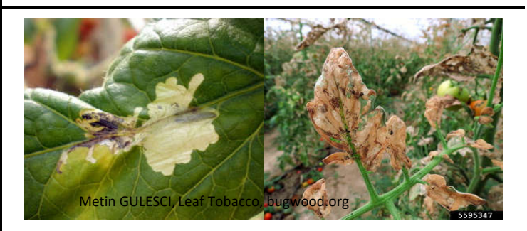
Tomato leafminer, Tuta (Phthorimaea) absoluta Hosts: Tomato, other Solanaceae Not present in Canada / CFIA REGULATED