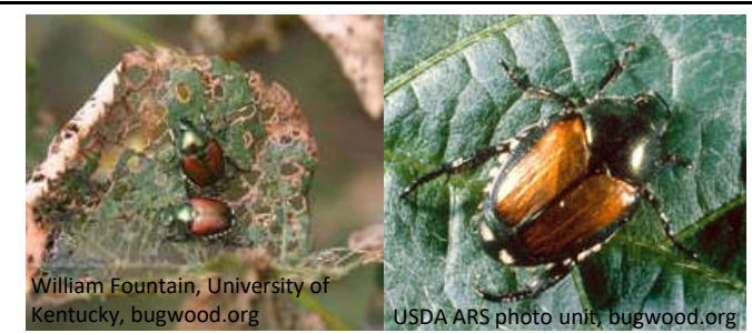
Japanese beetle, Popillia japonica Hosts: Turf, fruits, vegetables, ornamentals Limited distribution in B.C.: Lower Mainland only CFIA REGULATED