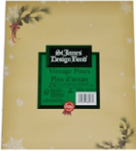
Vintage Pine Holiday Theme Paper 7530681071

Try one or all three of our holiday themed note paper.