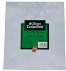
Let It Snow Holiday Theme Paper 7530681072

All three of these festive paper designs are only $3.00 per package.