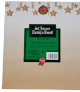
Stardust Holiday Theme Paper 7530681070