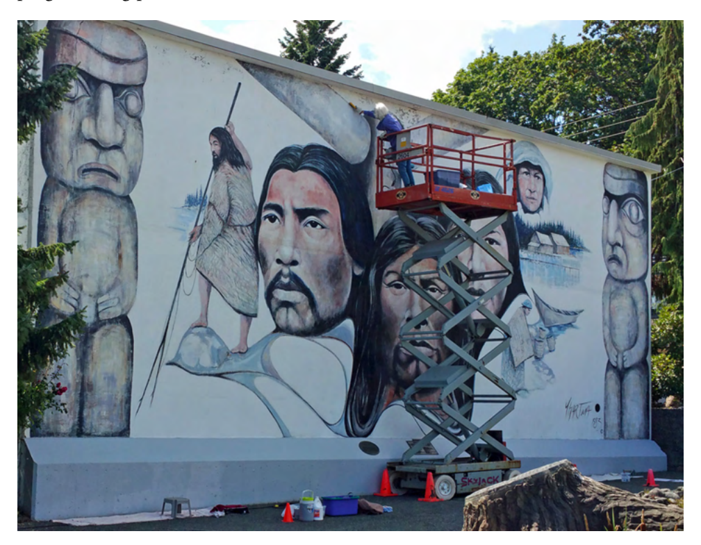
Chemainus Festival of Murals Society.

Generally, there can only be one regional organization by sector/sub-sector. Regardless of the local, regional or provincial status of an organization, each application is assessed on its own merit, based on the size and scope of the programming presented.