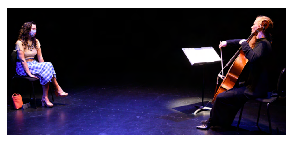
Music on Main Society.

If an organization is unsure which sector their program(s) fall within, the application should be submitted in the sector that aligns most closely with the organization's purpose(s), as outlined in the constitution, or with the majority of the organization's eligible programming.