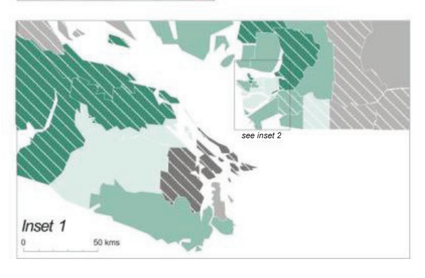
Note: Ratio - Observed over the expected. Refer to Figure 1 to clarify geographical location of LHAs.