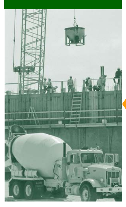
Targeted Legislative Changes