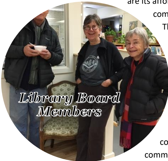
Library Board Members

land, natural environment, and walkable distances to most amenities are also draws for this demographic.