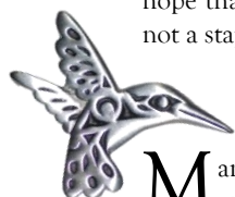
Hummingbird Brooch #9999840736 $16.95

The DCV has great gift ideas no matter what your budget. Check out the home décor pieces, functional art, tried-and-true cookbooks, elegant scarves, garden gift sets, tasty spreads, artisan jewellery, trendy travel mugs, and kitchen and dining items. (If you give her something from our office products division, we hope that it is a Bluetooth headset and not a stapler or retractable stapler.)