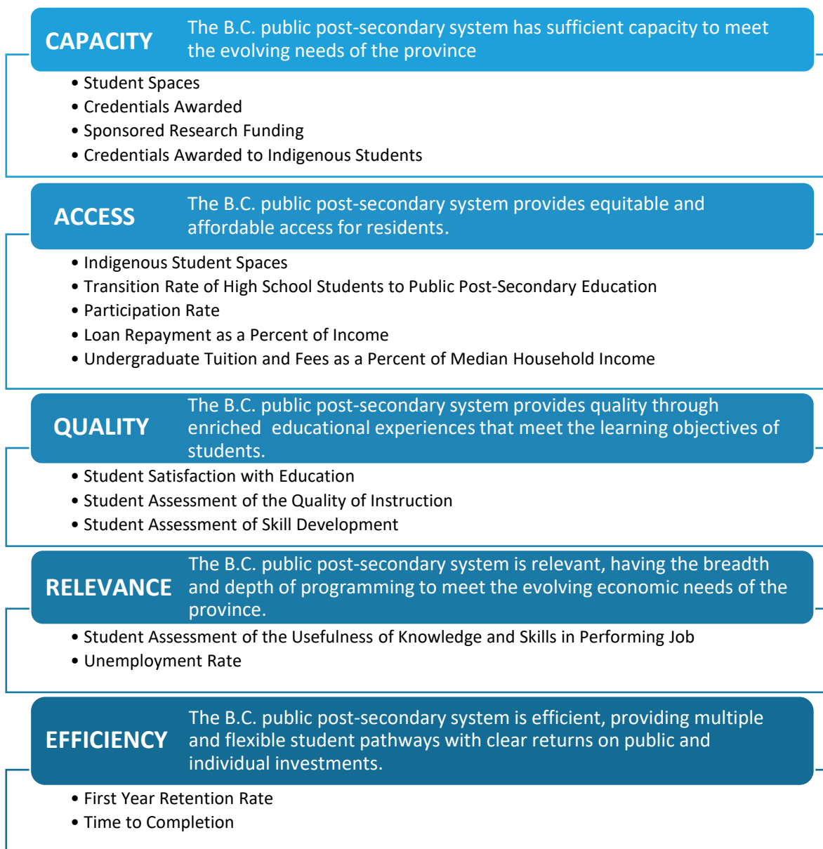
FIGURE 2. STANDARD PERFORMANCE MEASURES BY SYSTEM STRATEGIC OBJECTIVE