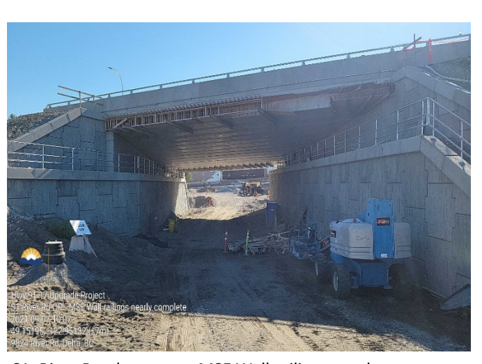
complete. Taken September 7, 2021