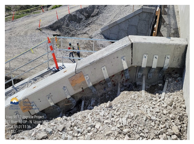
S1: River Road structure N. upper MSE Wall. Taken September S1: River Road structure MSE Wall railings nearly 1, 2021