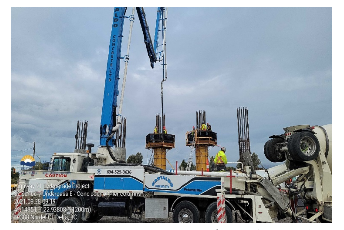
S2 Sunbury structure concrete pour of pier columns. Taken September 28, 2021