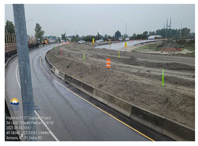
S4: Placed preload embankment fill. Taken September 14, 2021