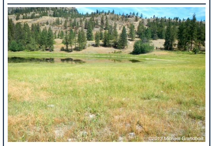
Figure 2 New population discovered in 2013 in wet meadow adjacent to Rattlesnake Lake near Oliver, B.C.