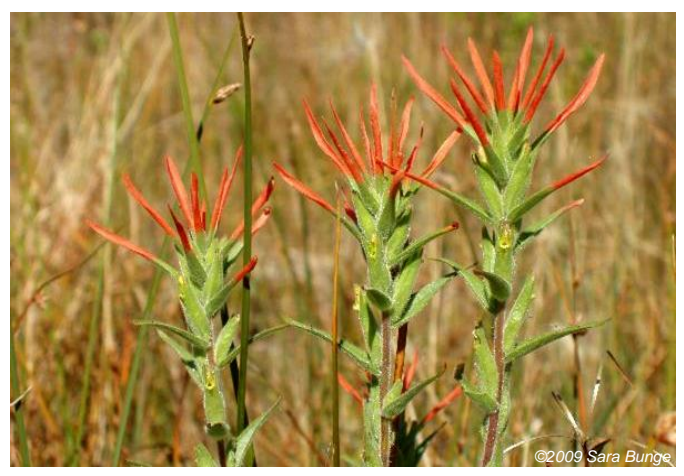
Figure 5 Close up of red-tipped bracts at tops of tall, narrow plants