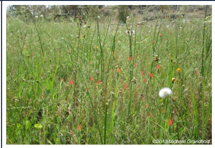
Figure 6 Red-tipped bracts are visible in dense tall vegetation