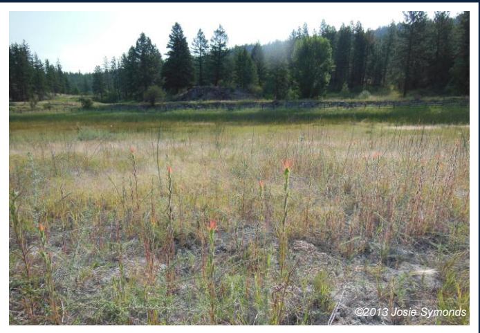
Figure 3 Saline wet meadow habitat near Mahoney Lake, B.C.