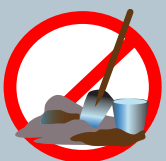
Dirt and sand