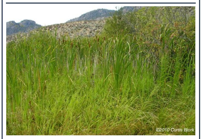
Figure 2 Cattail marsh habitat near Osoyoos (with Verbena hastata)