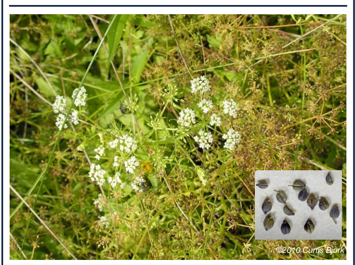
Figure 5 Close-up of flowering plant with early fruits; (inset: close-up of mature fruits)