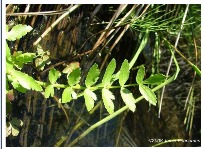
Figure 6 Basal leaf with irregular lobes and rounded teeth