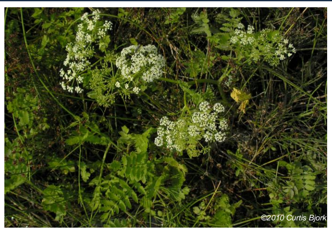
Figure 3 Flowering plants in typical habitat