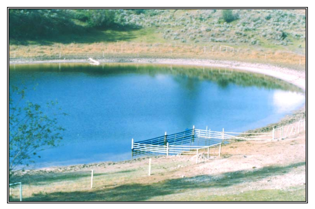
Restricted Livestock Access To A Pond

Unrestricted Access. This option may have the greatest risk of pollution unless carefully matched to the livestock use. Evaluate such access with the characteristics of the site and degree of expected livestock activity in mind. This type of access is commonly used on sites of low density grazing, such as on dryland pastures. It may not be appropriate for high-use sites, such as summerlong grazing on irrigated pastures.