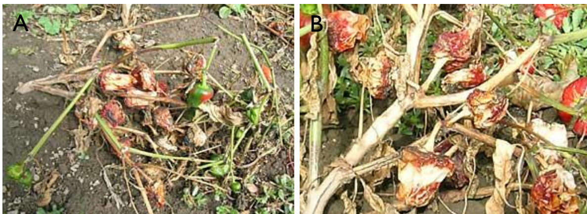
Figure 2. Pepper plants killed by phytophthora blight.

areas that become covered with a white to gray mold. Infected fruit dries becomes shrunken and wrinkled and remains attached to the stem.