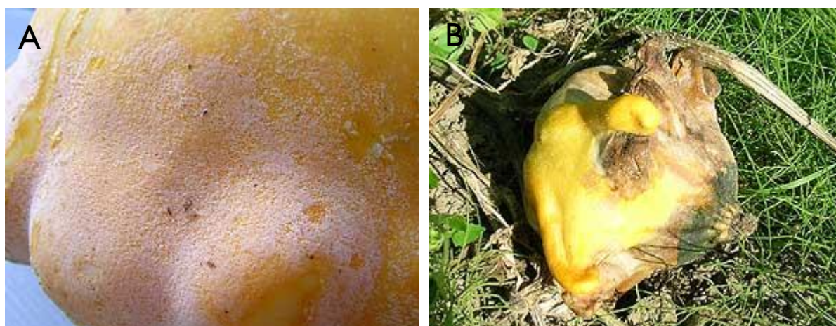
Figure 2. Gourd fruit covered with white cottony growth (A) and a mummified fruit (B), infected with Phytophthora capsici