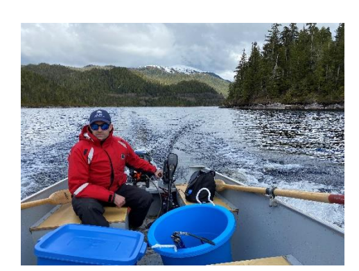
Sampler on Diana Lake, Prince Rupert.

The BCLSMP relies on volunteer samplers, and annual training helps to ensure the best possible data collection. The Ministry and BCLSS would like to welcome all our volunteers on board for the 2023 monitoring season and look forward to working with all of you.