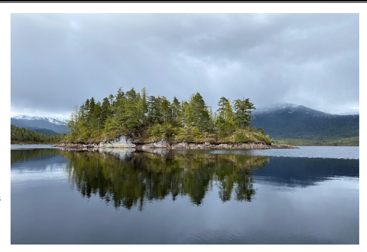
Diana Lake, Prince Rupert. April 2022.