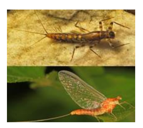
Above: Mayfly nymph. Below: Mayfly adult.

This event often results in mass clouds or swarms of mayflies which can completely cover stationary objects.