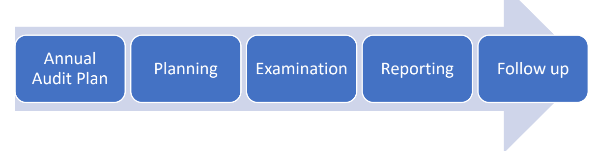
Figure 2-1: Audit Process

Auditing is an iterative process, and the audit team may not always follow a linear path through the steps presented below. While the audit process is intended to be flexible to maximize the efficiency and effectiveness of individual audits, any substantive departures from the Reference Manual must be documented and discussed with the Chief Auditor.