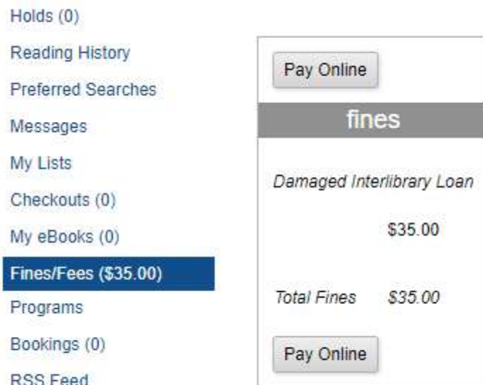
Example of E-Commerce solution appearing in patron account, powered via PayPal.

Additionally, TNRL subscribed to Canada Helps for the first time in 2020, increasing our ability to accept online donations with automated charitable receipts.