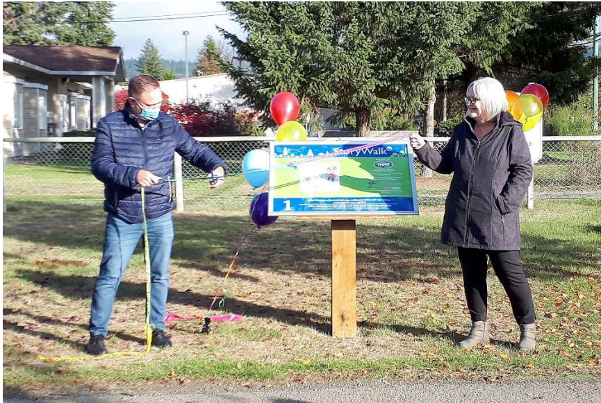
Ribbon cutting for Barriere Library's StoryWalk®

To date, three titles have been shown, with positive attention from both the media and patrons. Unsolicited donations have come forward to support this initiative.