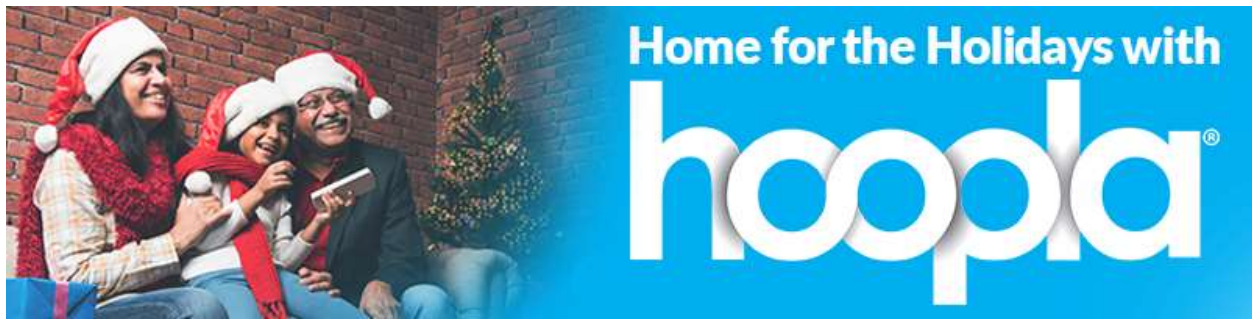
TNRL website banner featuring hoopla Digital.