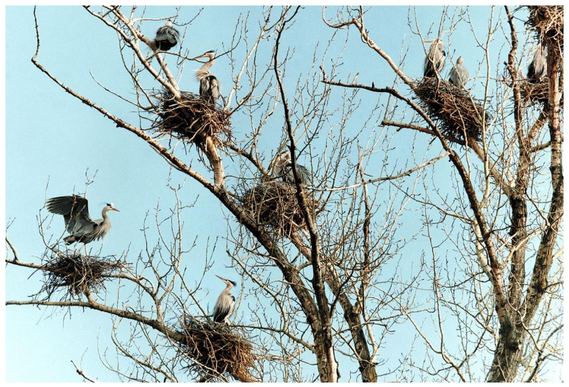
Figure 17. Great Blue Heron nesting colony.

A nest of a Great Blue Heron (Ardea herodias) means the nest and its supporting structure that either (1) is currently occupied by a Great Blue Heron to hold its eggs or offspring, or (2) is habitually occupied and still capable of holding eggs or offspring of a Great Blue Heron (Figure 17).