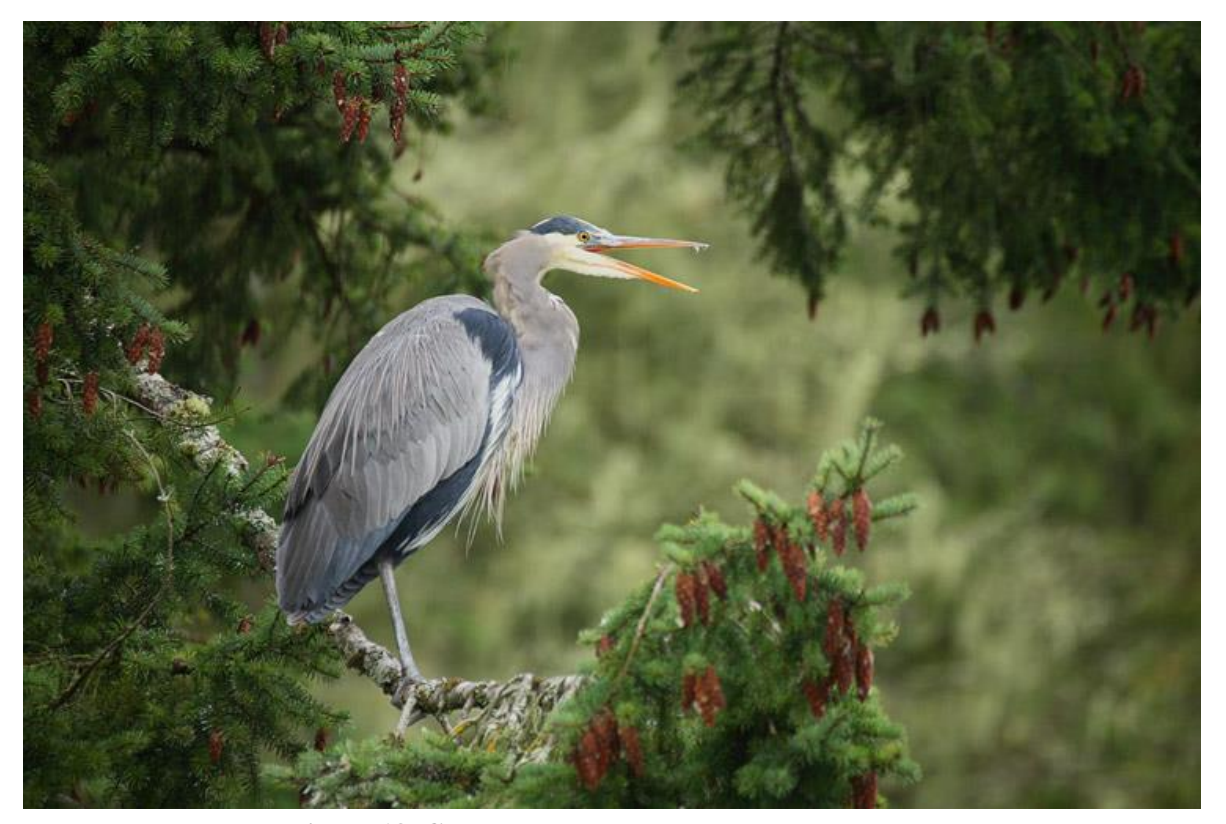
Figure 18. Great Blue Heron.