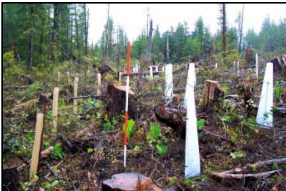
Figure 6. Freegro (left), Sinocast (front right), and Growcone (back right) seedling protectors.

studies in second growth stands. The stem analysis trees will also be used to assess the physical and chemical wood properties that relate to strength and rot resistance of western redcedar. Since most of the lower productivity sites on the north coast are currently considered inoperable, there is very little information available on the properties of the wood from these sites. The wood properties and chemical analysis work is being done by Forintek at UBC, and will compare levels of rot resistant chemicals from these stands with those from other areas.