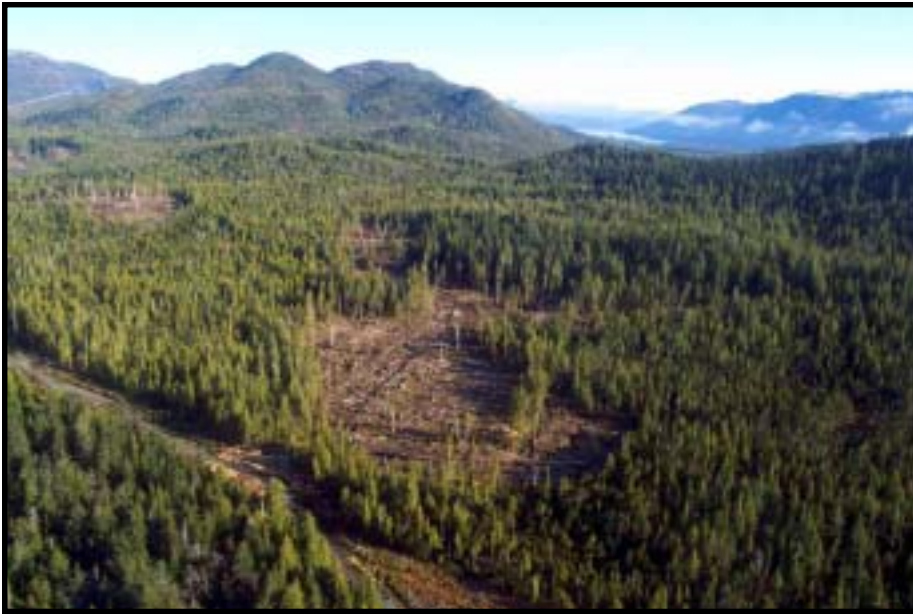
Figure 8. Aerial view of Block 1 showing the irregular ecosystem-based boundaries and leave trees (individuals and patches).

combined with the perceived positive benefits of logging and site preparation disturbance on second growth tree productivity, presents some significant operational challenges. While there is a need for some site disturbance, there are also site-specific and weather-specific limitations that must be recognized by operators in order to avoid site degradation and off-site (stream) impacts. The Oona River blocks consist primarily of the 01 site series, but typically vary in slope and soil characteristics throughout the blocks. Variation in slope and depth of organic and mineral soil horizons presented conditions that responded quite differently to machine traffic, especially during wet periods. Flat and gently sloping areas with deeper organic soils, as well as areas that were shallow to bedrock had much greater potential for soil puddling and surface water ponding, especially if operations were not suspended during wet periods. Changes to the current operational shutdown guidelines may be required to ensure these sites are not degraded. The use of low ground