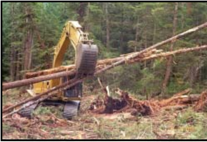
Figure 4. Excavator 'hoe-chucking' logs to main skid trail.