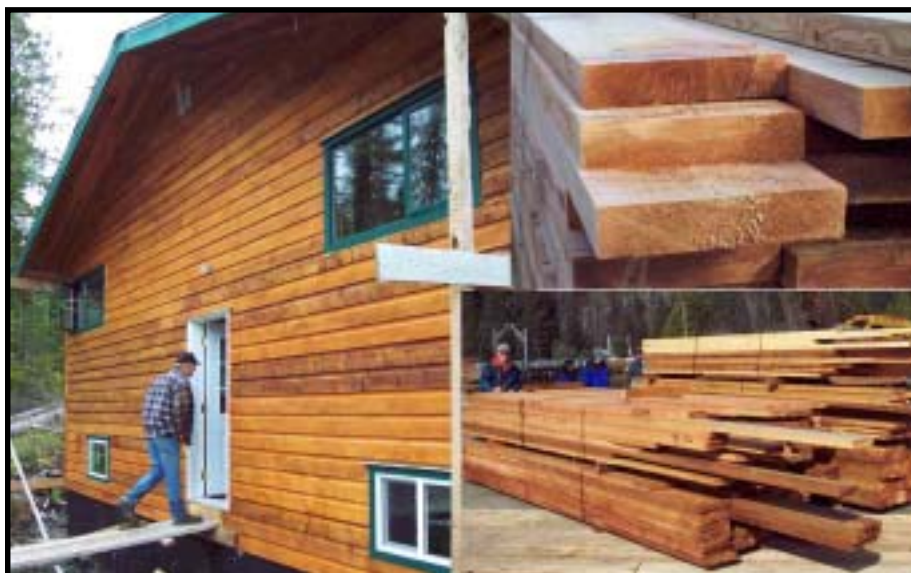
Figure 11. Some of the high quality redcedar siding and dimensional lumber produced at the Group Mills operation at Oona River.

Even more wood could be recovered if the logs were processed in a