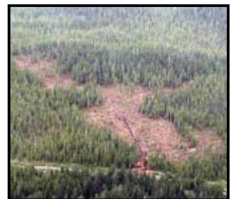
Figure 3. Main corduroy skid road built through block 1.

felled; neither species was being considered as a crop tree for the next rotation, so leave tree specifications were not required. Hand felling was completed over a period of several weeks. The main skid roads were constructed by an excavator using non-merchantable wood (rotten logs, snags, under-sized hemlock) as corduroy material. One main skid road was constructed through the centre of each block with short spurs constructed to access block extremities (Figure 3). Logs were “hoe-chucked” to the main skid roads