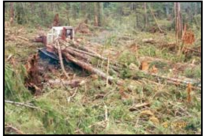
Figure 5. FMC tracked skidder moving logs to the landing.

using a CAT 320L, wide-tracked (32 inches) excavator (Figure 4) and moved to the haul road by a low ground pressure (< 6.0 psi) FMC tracked skidder equipped with chokers (Figure 5).