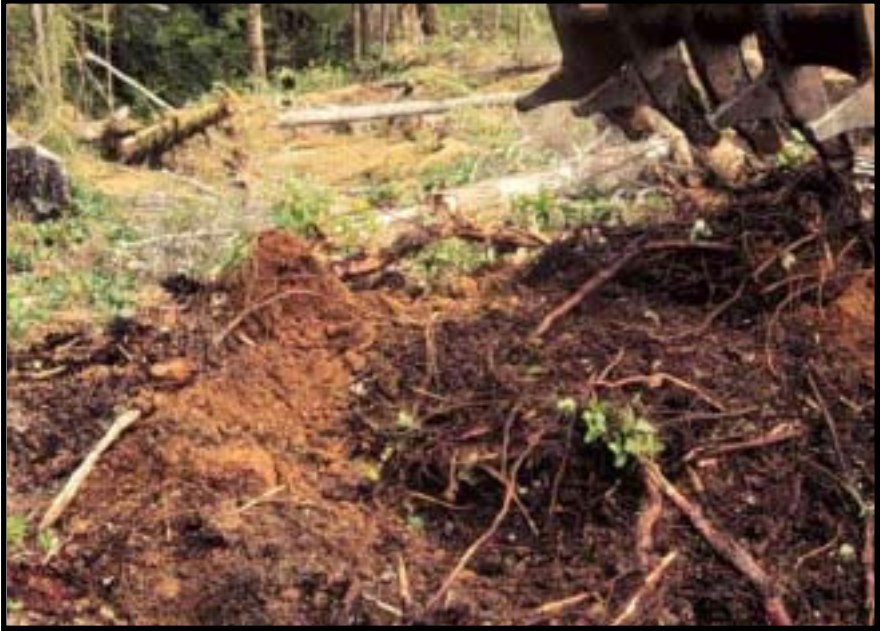
Figure 9. Mixed mineral and organic mound on a CWHvh2/01a site.

From the above discussion, it is apparent that machine operators must receive a basic level of training on recognizing soil conditions that are appropriate for applying site treatments. From an operational perspective (based on feedback from the machine operators) it makes sense to combine logging and