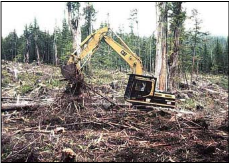
Figure 10. Excavator raking and piling slash on Oona River trial block.

can apply the appropriate raking and/or mounding treatments opportunistically as they retreat from that area of the block. Planters will then be instructed to utilize the natural, as well as artificially created raised microsites in order to achieve the optimum planting density.