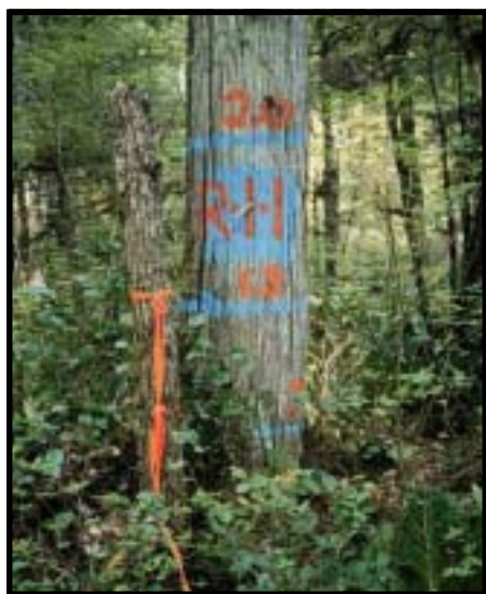
Figure 7. Redcedar sample tree marked for stem analysis cutting.

Thirty-seven dominant and co-dominant sample trees were identified prior to harvest to be used for stem analysis (Figure 7). The sample trees will provide growth history and old-growth site productivity information to refine existing site index and rotation length estimates for these lower productivity sites. Growth history data from the operational trial is being compared with data gathered from the Smith Island and Diana Lake old-growth study sites and with ongoing growth