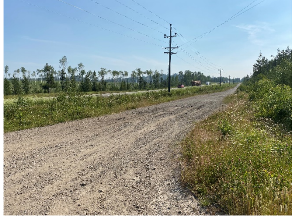
Photo 12: View of Guest Frontage Road from the Shallow Bay Road intersection.