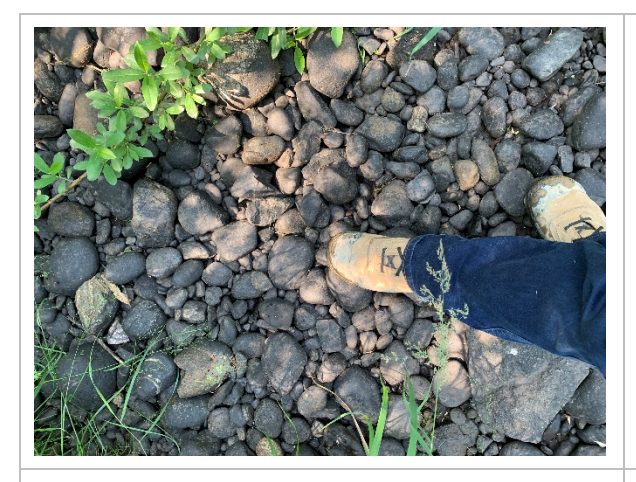
Photo 7: The channel substrate immediately downstream of the existing crossing.