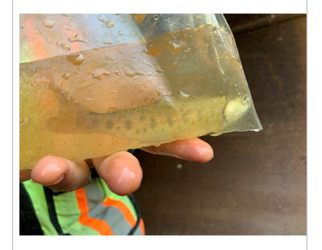
Photo 6: Rainbow trout observed within a pool of the lowest baffle (within the culvert).