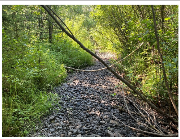
Photo 4: View downstream of the dry channel south of the 2400 mm steel culvert.