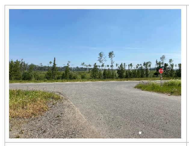
Photo 1: View north of the Shallow Bay Road intersection with Highway 16.