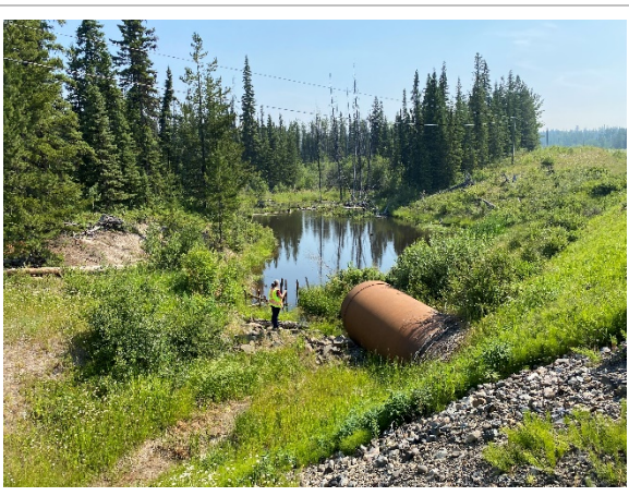
Photo 8: The pond immediately upstream, of the existing crossing, looking northeast.