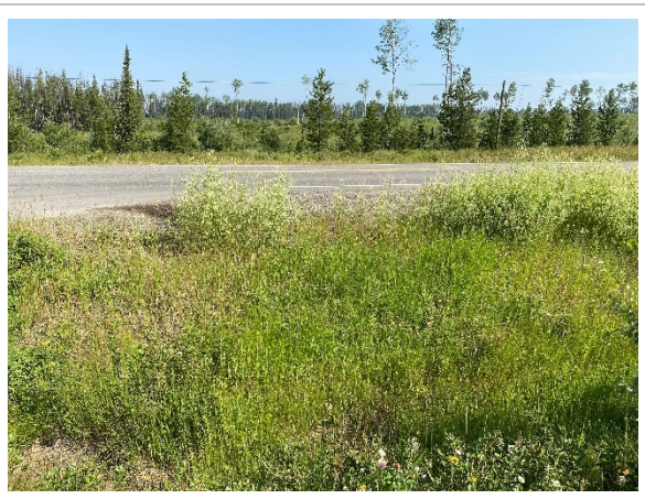
Photo 2: View north of roadside vegetation at the Shallow Bay Road intersection with Highway 16.