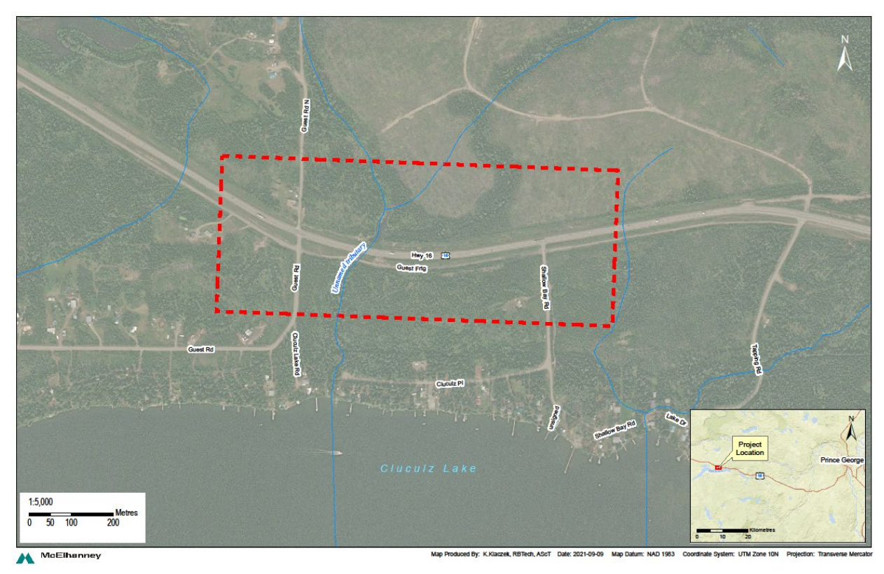
Figure 1. The geographic location of the study area (approximate boundary in red).

The British Columbia Ministry of Transportation and Infrastructure (MOTI) has initiated planning for the improvement of both the Shallow Bay Road and Guest Road intersections along Highway 16. Improvement works include widening the highway for the construction of turning lanes. The intersections are located north of Cluculz Lake and are situated approximately 590 m apart (with Guest Road furthest west). Figure 1 below shows the geographic location of the study area, approximately 60 km west of Prince George, BC.