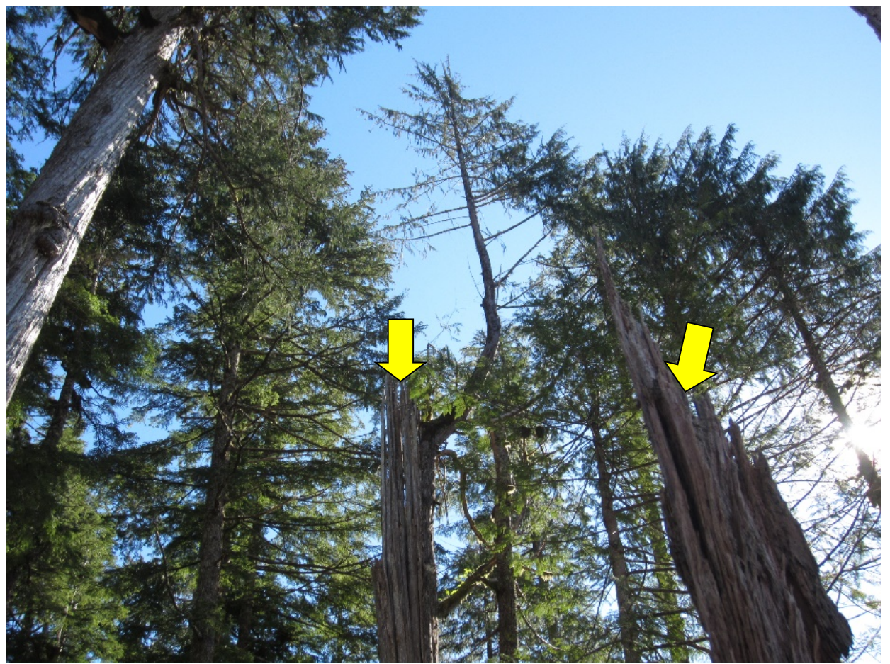
PHOTO 1: Example of two suspect trees visible from a work site. While both trees look bad (they both have defects which are at high risk of collapsing), they are not declared dangerous IF the hazardous parts are not able to physically reach the work site. Consequently, they can be safely retained – the acceptable conclusion of a proper risk assessment.

If the assessor identifies suspect trees (see photo 1) that are within the Perimeter Zone, it is incumbent upon the assessor to review the trees amidst their surroundings and determine whether the trees pose an imminent hazard, and whether the hazardous portion of the tree can reach the work site.