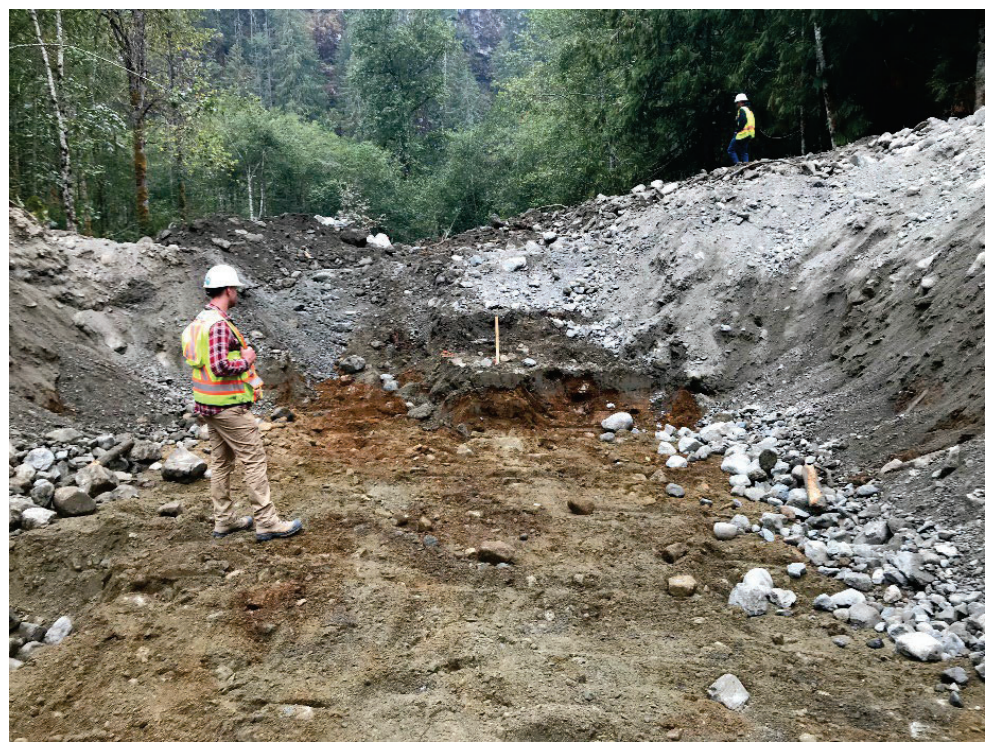
Photo 1: Looking west at the culvert excavation for the creek at km 10.9