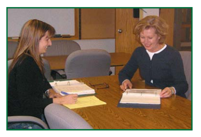
Finance and Administration staff at the Tree Seed Centre.

These business areas include Finance and Administration, and Facilities and Site Operations. Finance and Administration staff play a key role in supporting office, staff and expenditure/revenue budget management.