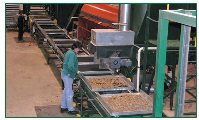
Cone and seed processing.

and seed processing volumes are three times that of the past 10-year average. Currently, the TSC is processing about 10 000 hectolitres each year. In order to meet these increasing production levels, cone and seed processing operations run continuously throughout the year, at times on a more than one-shift basis. Staff at the TSC are also seeing an increase in requests for expedited processing and service complexity, particularly for those production, family and research lots originating from seed orchards.