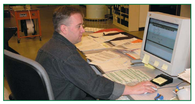
Tree Seed Centre staff using the SPAR program.

The TSC utilizes a two-level information management system. The corporate Seed Planning and Registry (SPAR) web-based system captures seedlot and service request data. It is used by both the Ministry of Forests and Range, and industry clients. The local Cone and Seed Processing system (CONSEP) captures significant volumes of detailed data, and receives and sends high-level and summary data to SPAR. These systems work together to capture seedlot and request data, to schedule and report outcomes and to support "just-in-time" service delivery and decision management. Systems also support financial and administrative operations and play a key role in continuous improvement and knowledge management.