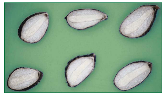
Inspections of lodgepole pine seed.