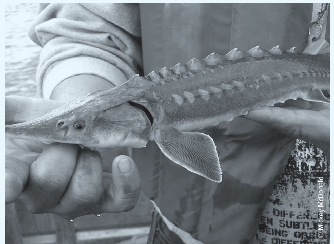
Conservation-cultured juvenile sturgeon recaptured at age two.

White Sturgeon in the Omineca Region, please call the Ministry of Water, Land and Resource Stewardship at 250-614-7400. For more information on Nechako White Sturgeon, including Nechako White Sturgeon Conservation Centre in Vanderhoof, BC, go to: www.nechakowhitesturgeon.org .