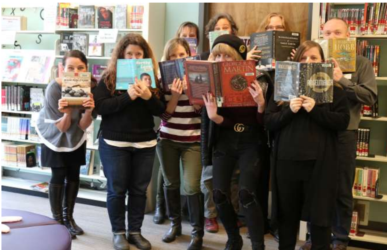
2019 GDPL Staff Team

We have completed the first year of our 2019 to 2022 Strategic plan. Our four primary goals of Building Community, Encouraging and Enabling Lifelong Learning, Invigorating People and Culture and Creating Welcoming Spaces and Resources drive our planning, decision making and reporting. GDPL was busier than ever in 2019 with substantial increases in program participation and active patronage as our Annual Report demonstrates.