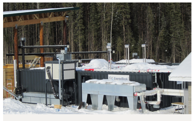
Biomass Plant at Kwadacha