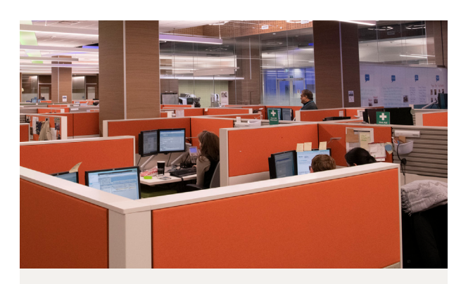
Renovations at Hamilton Centre