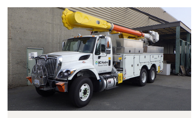
Heavy Hybrid Truck front view