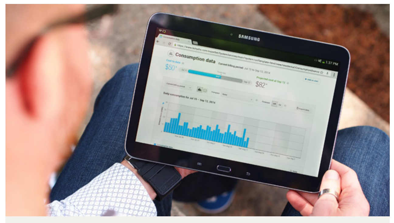
Electronic billing reduces paper consumption.

We continue to have one of the highest rates of paperless billing among those utilities surveyed by the Canadian Electricity Association. This adoption rate is facilitated by our efforts to make it easier for customers to pay their bills via the option of detailed email bill notifications including the amount owing, due date and electricity usage.