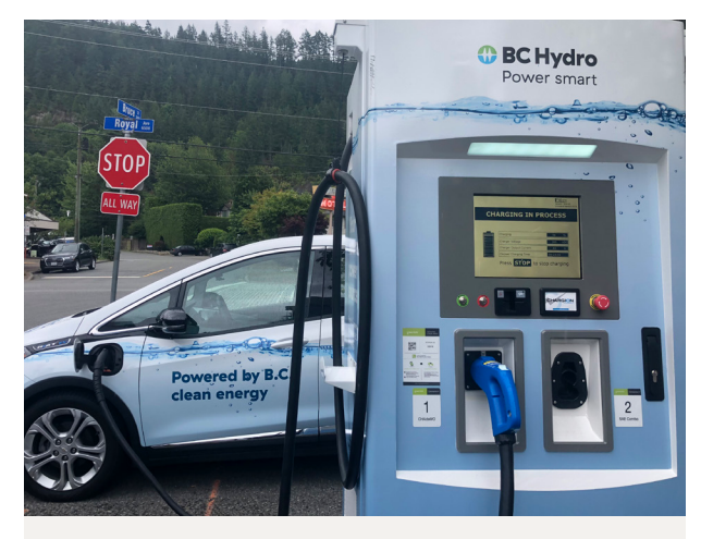
Chevrolet Bolt vehicle charging