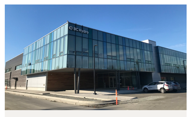
Victoria District Office