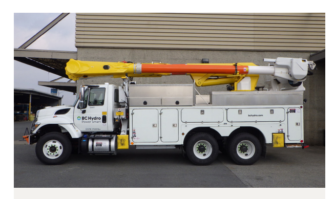
Heavy Hybrid Truck side view