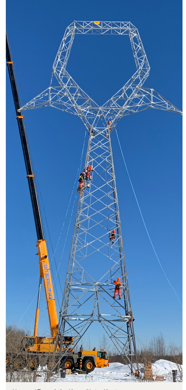
Upgraged Transmission Lines withstand icestorms

After the 1998 ice storm in Eastern Canada and US, BC Hydro assessed the transmission network and began to upgrade 230kV and 500kV transmission lines to withstand 1-in-200 year return period ice loadings. The newly constructed lines were designed using reliability based design principles to withstand 1-in-200 and 1-in-100 year return period weather loadings, respectively. Similarly, 500kV and 230kV transmission lines under construction have been designed to withstand 1-in-200 and 1-in-100 year return period weather loadings.