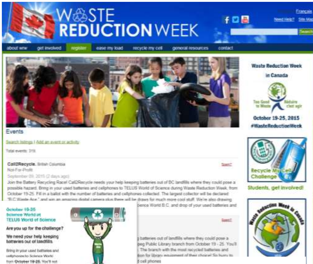
Above & left: Online and print promotions for Waste Reduction Week campaign with Science World BC.