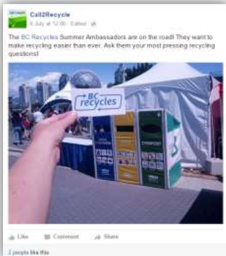
Summer Ambassador partnership with BC Recycles.