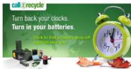
Daylight Savings campaign promotions.