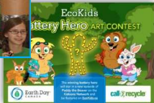
Below: EcoKids Battery Hero contest promotion with Earth Day Canada