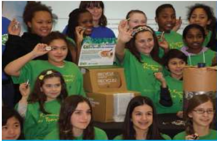
Left: Student Earth Rangers with their battery collections