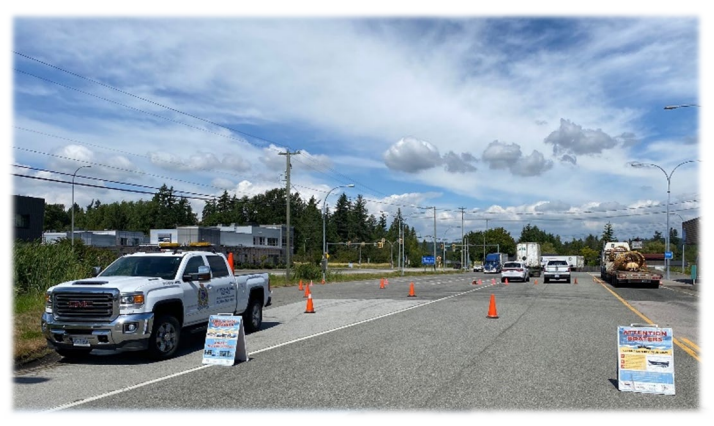
AIS crews work at inspection stations at key border crossings along the Alta. and U.S. borders, like this one in Douglas.

Invasive mussel inspection stations were operational from April 1 to October 24, 2021.