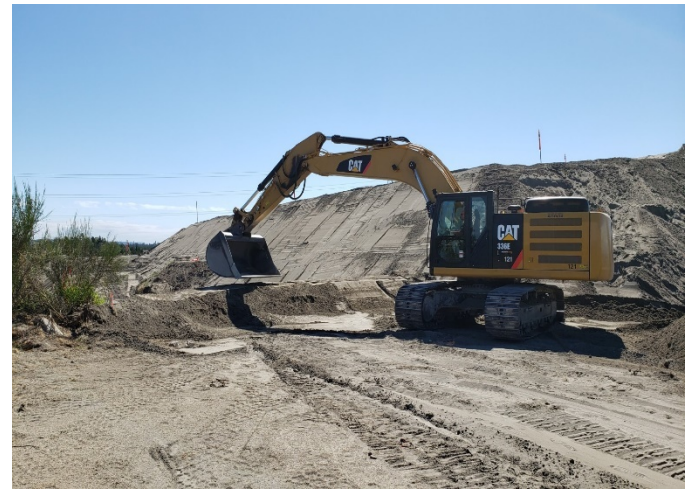
S2: L500/L575 – A PGC excavator cutting the placed preload/embankment fill slopes. Taken August 18, 2020