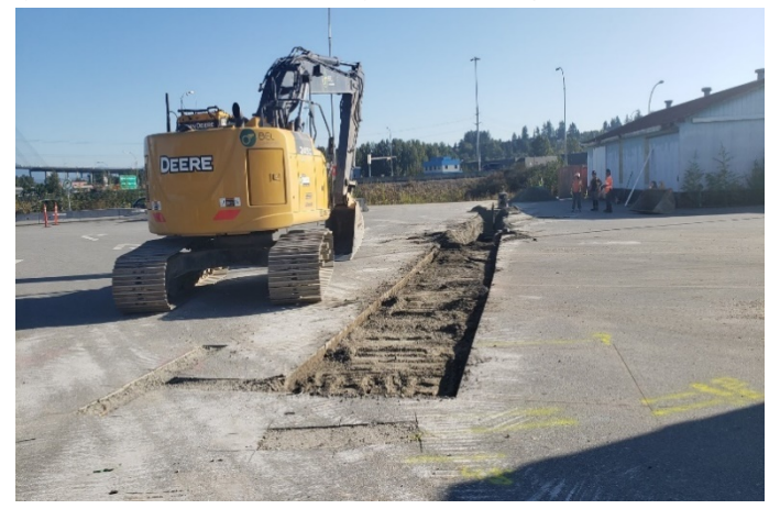
S3: Truck Parking Area – Watermain Construction – An excavator removing the existing asphalt pavement prior to final stretch of watermain installation. Taken August 27, 2020

HIGHWAY 91/17 UPGRADE PROJECT Monthly Status Report – August 2020