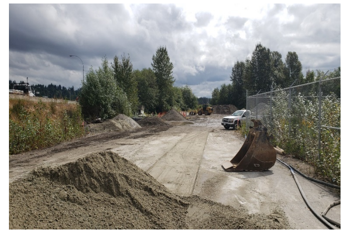
S4: BCTFA Property – Watermain Construction underway. Taken August 20, 2020