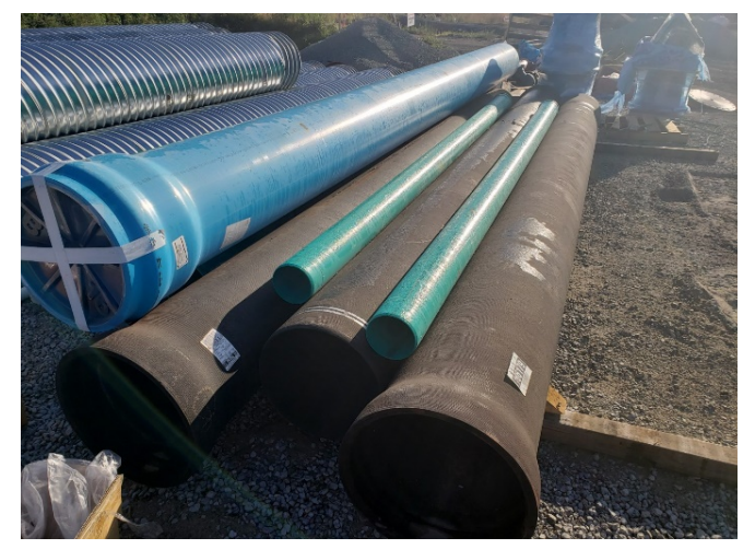
S1: River Road West Roundabout – Watermain Construction – Materials on-site, awaiting installation. Taken August 4, 2020