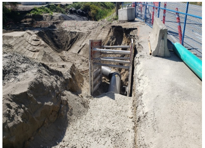
S1: River Road West Roundabout – Watermain Construction underway. Taken August 13, 2020