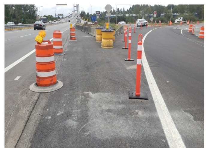
S4: E01 Detour – Hwy 91 NB Exit 8 awaiting diagonal line painting within gore area. Taken August 7, 2020